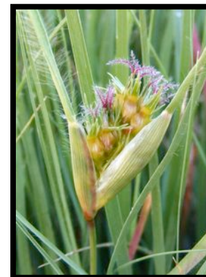
buffalo grass in bloom

Many years ago I planted buffalograss from seed. This was before the UC developed their version of seedless buffalograss. Today "my" buffalograss produces its precious miniature blossoms as part of its seed-producing cycle (see photo). Full disclaimer -- I have not developed the allergies that seem to plague so many denizens of the Central Valley. I am also enthralled with the cycle of life so I take great pleasure in watching the grass bloom. The seed heads are part of that cycle and I like them. Yeah, I know I've moved way beyond that desire for an outdoor green carpet. For me, plants are now all about life and I'm lucky to not live under an HOA or have neighbors who care.