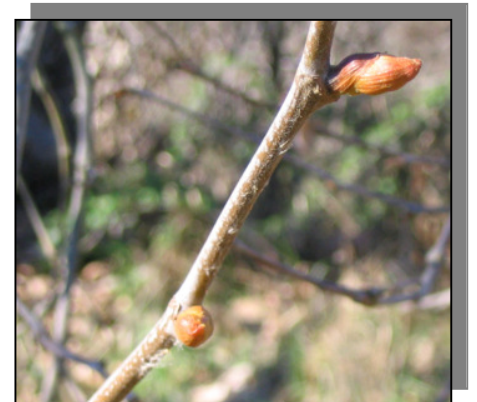
California Sycamore buds at China Creek

If you need help finding the park (or finding us), call 281-8080. Hope to see you there.