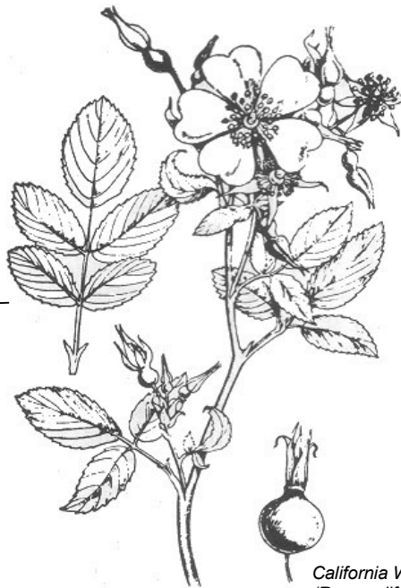
California Wild Rose ( Rosa californica )

Saturday Sept. 26, 2009 8 am - 1 pm Clovis Botanical Garden (945 North Clovis Avenue)