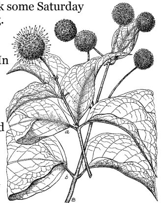
Cephalanthus occidentalis a. flower; b. fruit

Your help will be well appreciated. In the words of Jane Goodall, "What you do makes a difference, and you have to decide what kind of difference you want to make."