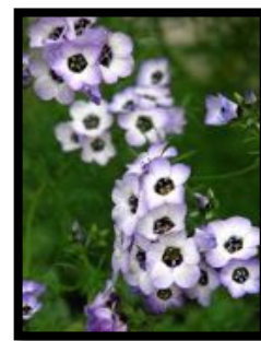
Bird's eye Gilia

My Cleveland Sage is out of bounds again, but I always enjoy the pruning, as the aroma from the bruised foliage is marvelous. As I moved over to trim the edges of my ground cover Bee's Bliss Sage I saw that it has flower stalks forming already. In my dry garden the Bird's Eye Gilia were wilting, not surprising as my soil is very sandy. That bit of rain last week perked them up and put on much new growth. The rain also invigorated my bicolor lupine, and I see Farewell to Spring germinating.