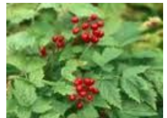
Actaea rubra Red Baneberry