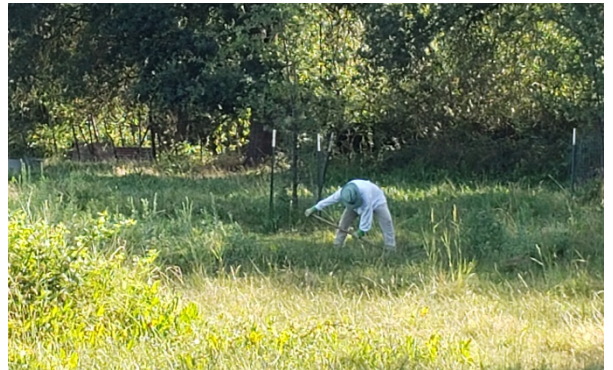
–Working hard at weeding; north leg of Park–