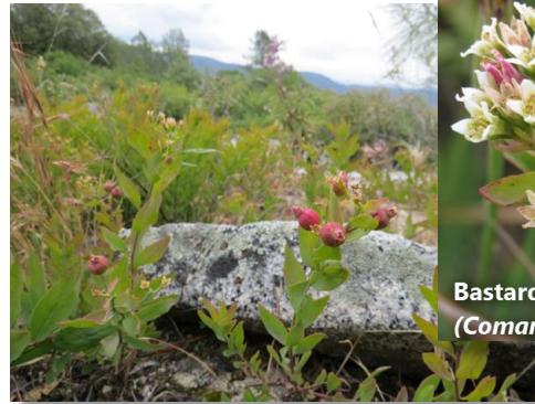
Bastard toadflax ( Comandra umbellata )