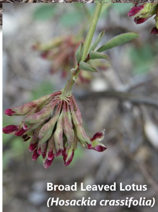
Broad Leaved Lotus ( Hosackia crassifolia )