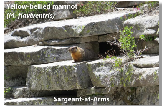
Yellow-bellied marmot ( M. flaviventris )