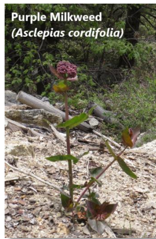
Purple Milkweed ( Asclepias cordifolia )