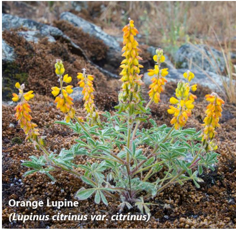
Orange Lupine ( Lupinus citrinus var. citrinus )