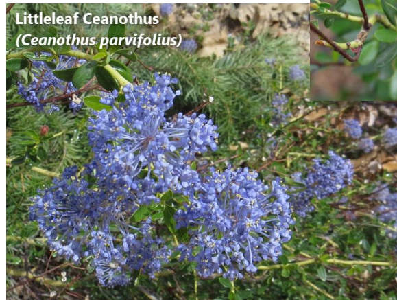
Littleleaf Ceanothus ( Ceanothus parvifolius )