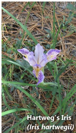
Hartweg's Iris ( Iris hartwegii )