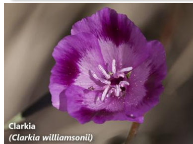
Clarkia ( Clarkia williamsonii )