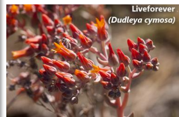
Liveforever ( Dudleya cymosa )