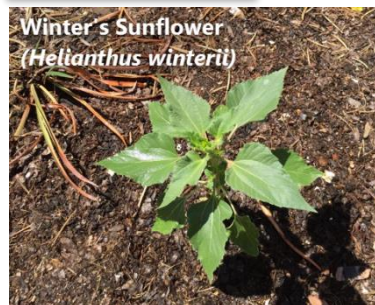
Winter's Sunflower ( Helianthus winteri )