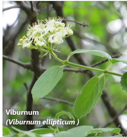
Viburnum ( Viburnum ellipticum )