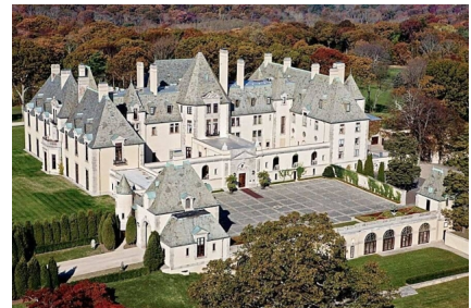
Oheka Castle, Oyster Bay