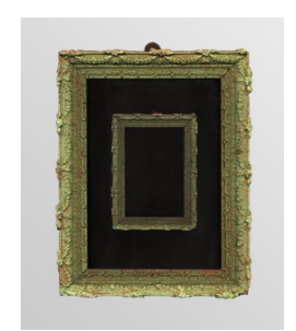
Rachel Phillips Green Swags , 2015 archival print in antique frame 10 x 9 in 25.40 x 22.86 cm