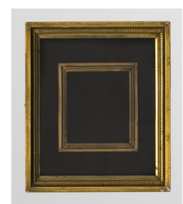
Rachel Phillips Gold Stripes , 2015 archival print in antique frame 11.50 x 9.50 in 29.21 x 24.13 cm