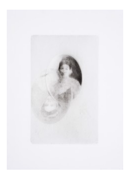
Andy Mattern Ghost No. 68 (AP/2), 2023 Platinum Print 13 x 9.62 in 33.02 x 24.43 cm Framed 14 x 10.62 in