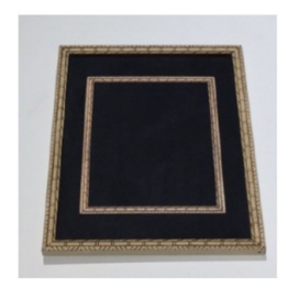
Rachel Phillips Tan Scheme, 2015 archival print in antique frame 10.75 x 8.75 in 27.30 x 22.22 cm