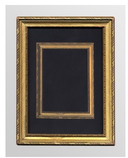
Rachel Phillips Golden Rope, 2015 archival print in antique frame