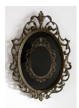
Rachel Phillips Italianate Oval, 2015 archival print in antique frame 7 x 5 in 17.78 x 12.70 cm