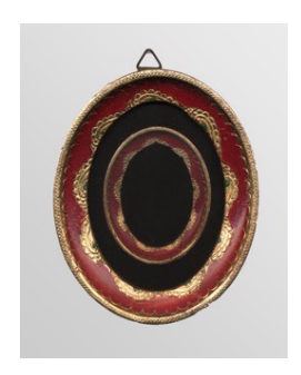
Rachel Phillips Red and Gold Scallops, 2015 archival print in antique frame 4 x 3 in 10.16 x 7.62 cm