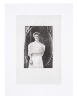
Andy Mattern Ghost No. 112 (1/2), 2023 Platinum Print 17.62 x 13.25 in 44.75 x 33.66 cm Framed 18.62 x 14.25 in