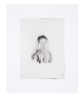
Andy Mattern Ghost No. 99 (1/2), 2023 Platinum Print 12.87 x 10.62 in 32.69 x 26.97 cm Framed 13.87 x 11.62 in