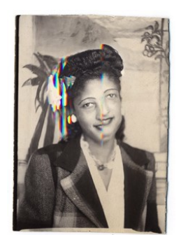
Rachel Phillips Painted Palms (AP/5 + 2AP), 2024 Archival Pigment Print Distressed with Watercolor, Pastels & Ink 3.12 x 2.25 in 7.92 x 5.72 cm