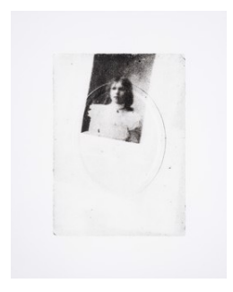
Andy Mattern Ghost No. 89 (1/2), 2023 Platinum Print 13 x 10.37 in 33.02 x 26.34 cm Framed 14 x 11.37 in