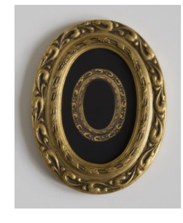
Rachel Phillips Golden Vines, 2015 archival print in antique frame 8.50 x 6.50 in 21.59 x 16.51 cm