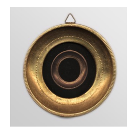
Rachel Phillips Perfect Circle, 2015 archival print in antique frame 3.25 x 3.25 in 8.26 x 8.26 cm