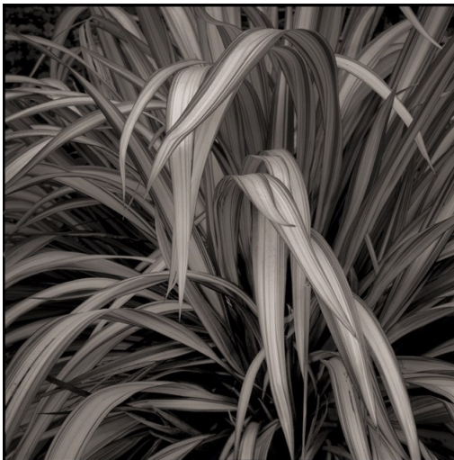
Mark Citret Variegated Mountain Flax #2, SFBG (3/7), 2020 Gelatin Silver Print 6.50 x 6.50 in Framed 17 x 14 in Unframed USD$1800/Framed $1950