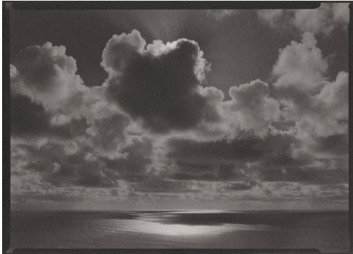
Mark Citret December 12 (2/22), 2012 Platinum/Palladium Print 5 x 7 in Framed 11 x 14 in Unframed USD$1200/Framed $1350