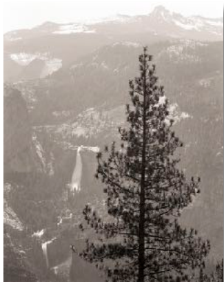
Vernal & Nevada Falls from Glacier Point/2018

The landscapes in my photographs in this exhibit represent very different environments: Death Valley sand dunes; Yosemite waterfalls, and one small one in New York's Catskill Mountains; the San Francisco Botanical Garden; the Pacific Ocean off the San Mateo County coast, right outside my back door. I love them all, and am privileged to be able to bear witness to their endlessly changing moods.