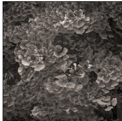
Mark Citret Turning Ginkgo, SFBG (2/5), 2021 Gelatin Silver Print 6.50 x 6.50 in Framed 17 x 14 in Unframed USD$1800/Framed $1950