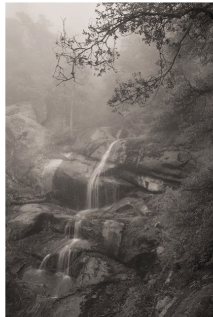
Mark Citret Chilnualna Falls Trail #14 (5/22), 2016 Platinum/Palladium Print 9 x 6 in Framed 17 x 14 in Unframed USD$1400/Framed $1550