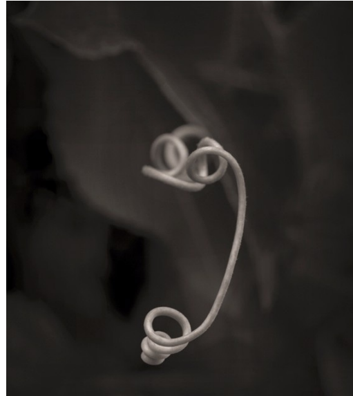
Mark Citret Passionflower #10, 2021 Platinum/Palladium Print 4 x 3.50 in Framed 14 x 11 in Unframed USD$1200/Framed $1350