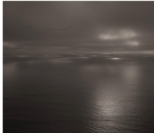
Mark Citret Pelicans, September (6/45), 2014 Gelatin Silver Print 9.50 x 10.50 in Framed 20 x 16 in Unframed USD$1400/Framed $1600