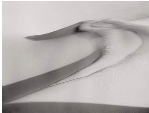
Mark Citret Dune #23, Death Valley (1/45), 2001 Gelatin Silver Print 6 x 8 in Framed 20 x 16 in UNFRAMED PRINT: USD$1200/ FRAMED:$1550