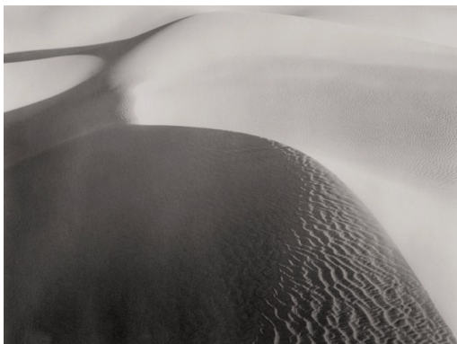
Mark Citret Dune #12, Death Valley (3/45), 1999 Gelatin Silver Print 6.50 x 8.50 in Framed 20 x 16 in UNFRAMED PRINT: USD$1200/ FRAMED:$1550