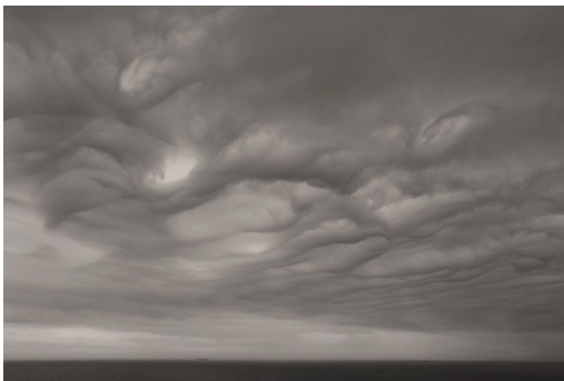
Mark Citret Asperitas Clouds (4/22), 2017 Platinum/Palladium Print 6 x 9 in Framed 14 x 17 in Unframed USD$1400/Framed $1550