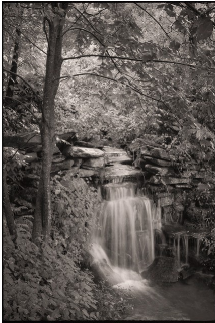
Mark Citret Small Waterfall, Catskills (2/22), 2011 Platinum/Palladium Print 9 x 6 in Framed 17 x 14 in Unframed USD$1400/Framed $1550