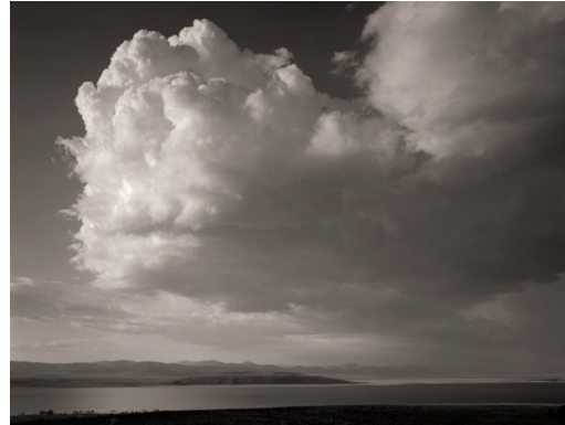
Mark Citret Cloud Over Black Point (14/32), 1994 Gelatin Silver Print 6.50 x 8.50 in Framed 14 x 17 in Unframed USD$1800/Framed $1950