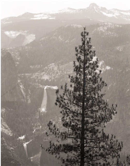
Mark Citret Vernal and Nevada Falls from Glacier Point (1/22), 2018 Platinum/Palladium Print 8 x 6 in Framed 17 x 14 in Unframed USD$1400/Framed $1550