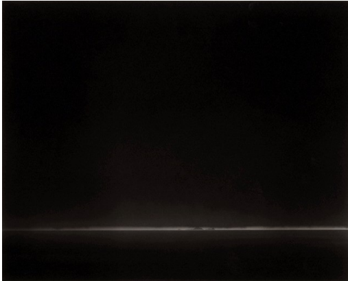
Mark Citret Black Sea and Sky (11/45), 1992 Gelatin Silver Print 7 x 8.50 in Framed 14 x 17 in Unframed USD$3000/Framed $3150