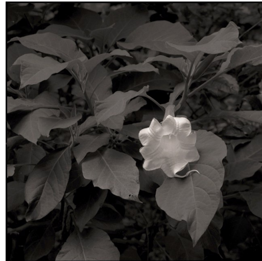
Mark Citret Angel Trumpet #2, SFBG (2/11), 2020 Platinum/Palladium Print 6.50 x 6.50 in Framed 17 x 14 in Unframed USD$1400/Framed $1550