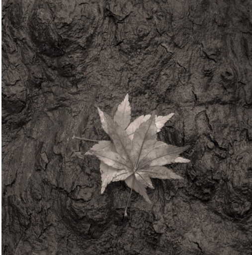
Mark Citret Maple Leaves on Plane Tree Bark, SFBG (2/5), 2022 Gelatin Silver Print 6.50 x 6.50 in Framed 17 x 14 in Unframed USD$1800/Framed $1950