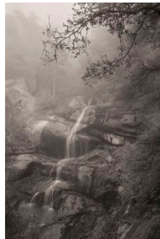
Chilnualna Falls Trail #14/2016