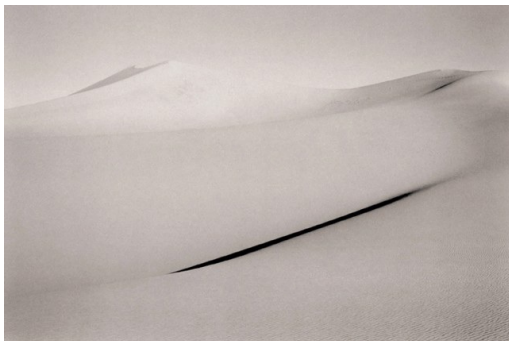
Mark Citret Dune #2, Death Valley (2/45), 1996 Gelatin Silver Print 5 x 7 in Framed 20 x 16 in UNFRAMED PRINT: USD$1200/ FRAMED:$1550