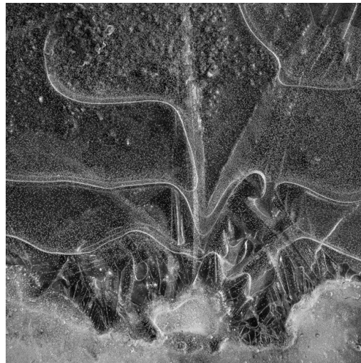
Cindy Stokes Sorcery (1/6) , 2018 Archival Pigment Print 22 x 17 in Framed 24.50 x 24.50 in USD$450 UNFRAMED/ $525 FRAMED