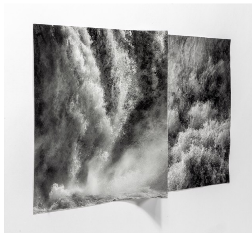
Cindy Stokes Form and Formless V , 2019 Unique Collaged and Folded Archival Pigment Print on Asuka Kozo Paper 16 x 29 x 3 in Framed 22 x 35 in USD$2190