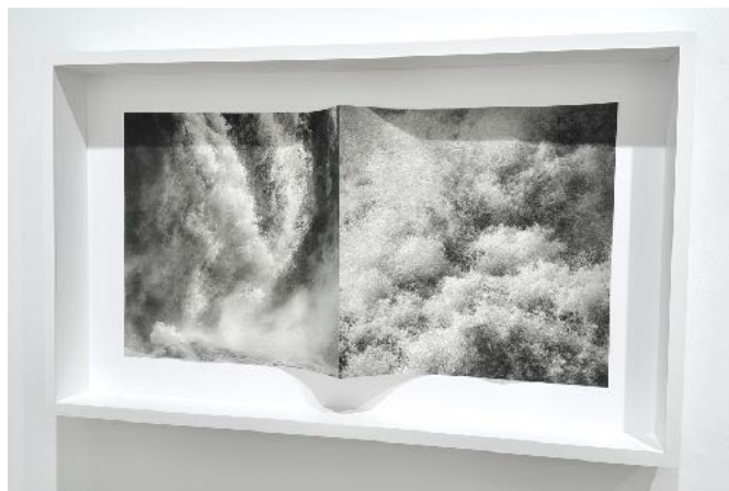
Form & Formless VI / 2019

Like all of nature, water is timeless and fundamental, known yet unknown. If I pay attention long enough, perhaps someday I'll understand.