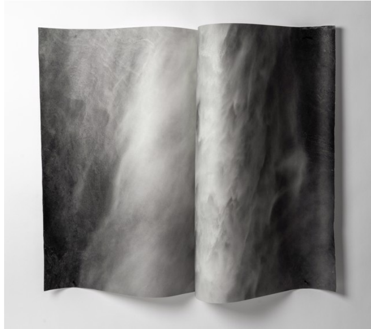
Cindy Stokes Form and Formless VIII, 2022 Unique Collaged and Folded Archival Pigment Print on Azuka Kozo Paper 20 x 26 x 3 in USD$1800