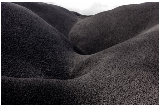
Susannah Hays Untitled No. 1 (1/20), 2023 Archival pigment print on Kozo 25.50 x 33.50 in Framed 23.50 x 31.50 in FRAMED PRINT USD$2000