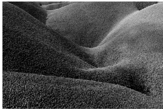
Untitled No. 1/2023

As above, so below, the soulful action of solar light touches Permian depths.