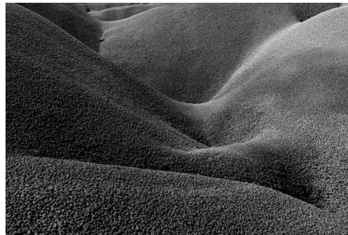
Susannah Hays Untitled No. 3 (1/20), 2023 Archival pigment print on Kozo 25.50 x 33.50 in Framed 23.50 x 31.50 in FRAMED PRINT USD$2000