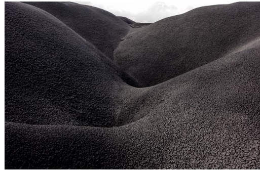
Susannah Hays Untitled No. 1 (2/20), 2023 Archival pigment print on Kozo 23.50 x 31.50 in UNFRAMED PRINT USD$1400