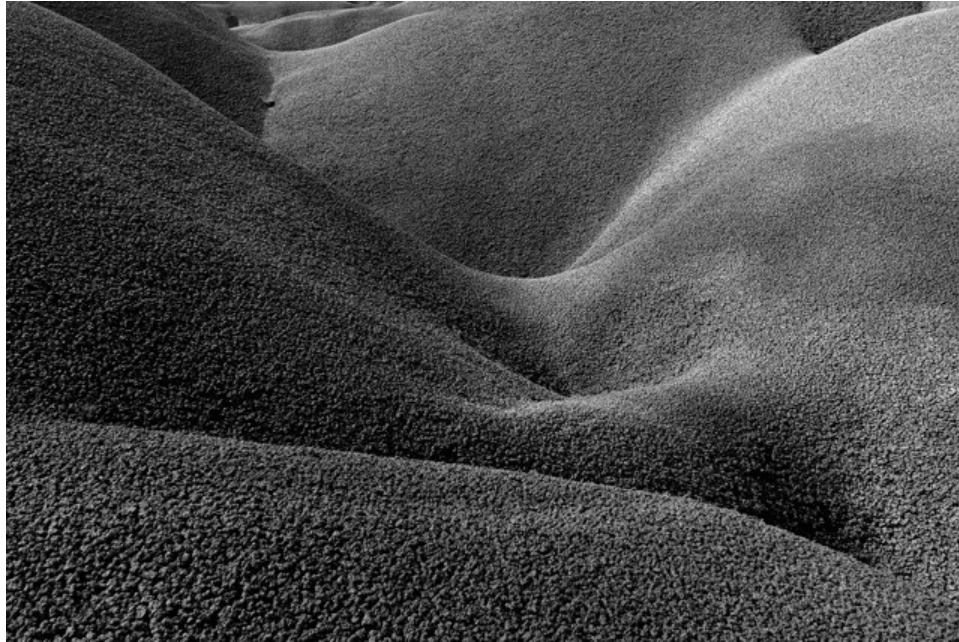
Susannah Hays Untitled No. 3 (1/10), 2023 Archival Pigment Print on Kozo Paper 24 x 36 in UNFRAMED PRINT USD$1900