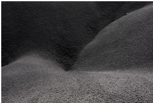
Susannah Hays Untitled No. 2 (1/20), 2023 Archival pigment print on Kozo 25.50 x 33.50 in Framed 23.50 x 31.50 in Framed Print USD$2000