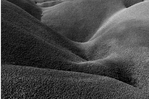
Susannah Hays Untitled No. 3 (2/20), 2023 Archival pigment print on Kozo 23.50 x 31.50 in UNFRAMED PRINT USD$1400