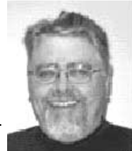
by Detlev Aeppel