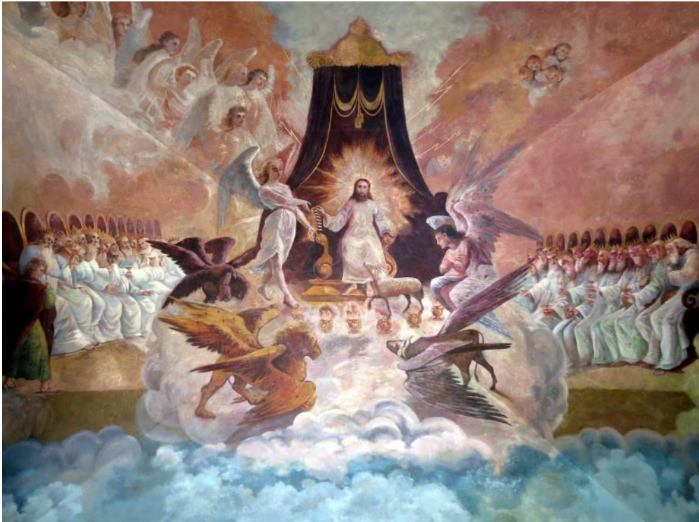
(Catedral de la Purísima Concepción (Tepic, Nayarit) - portal vault mural of Revelation Chapter 5 Verse 6)

You are so welcome to our worship every Sunday.