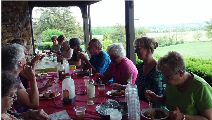
A perfect evening to eat on the porch.