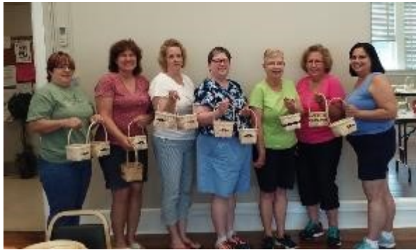
Berry Basket weavers

We have also collected goodies to place in the baskets. If you would like to donate please bring items to Odyssey. Items needed are personal/travel sized shampoo, lotion, toothpaste, deodorant, toothbrushes, lip balm, tweezers, nail clippers, socks. Monetary donations will also be accepted and used to purchase needed items. Please contact Suzanne Williamson at sgw59@comcast.net with any questions.