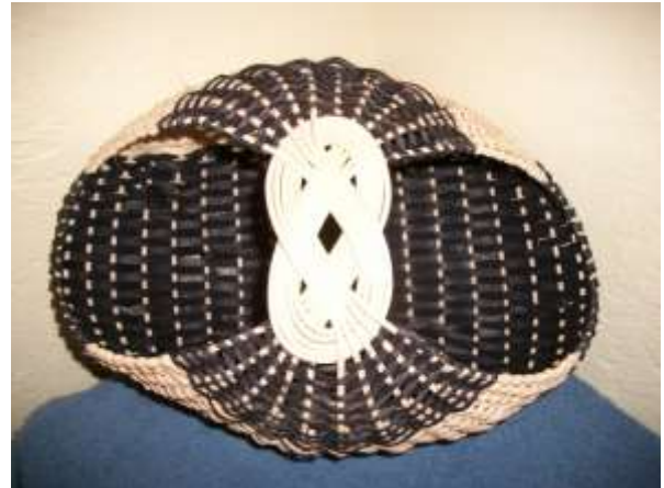
Natural ribs with dyed weavers

Sign up with Barbara by sending the completed form and your check for the pattern and kit by February 15, 2018.