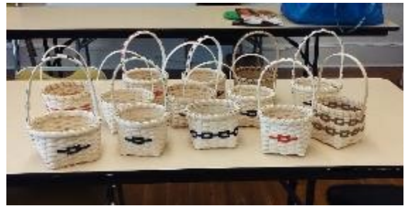
Some of the completed baskets