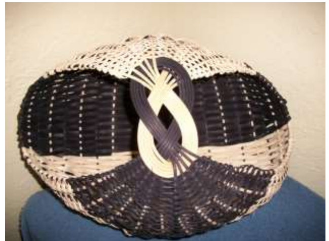
1/2 natural & 1/2 smoked ribs with dyed weavers