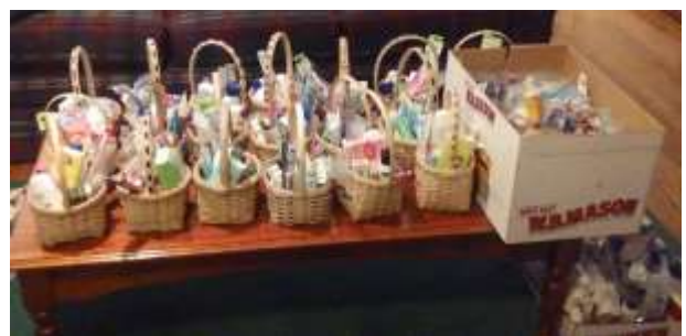
Baskets ready to be delivered.