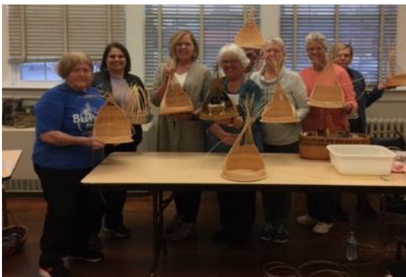
Left: Creche/display basket in November at East Berlin Community Center.