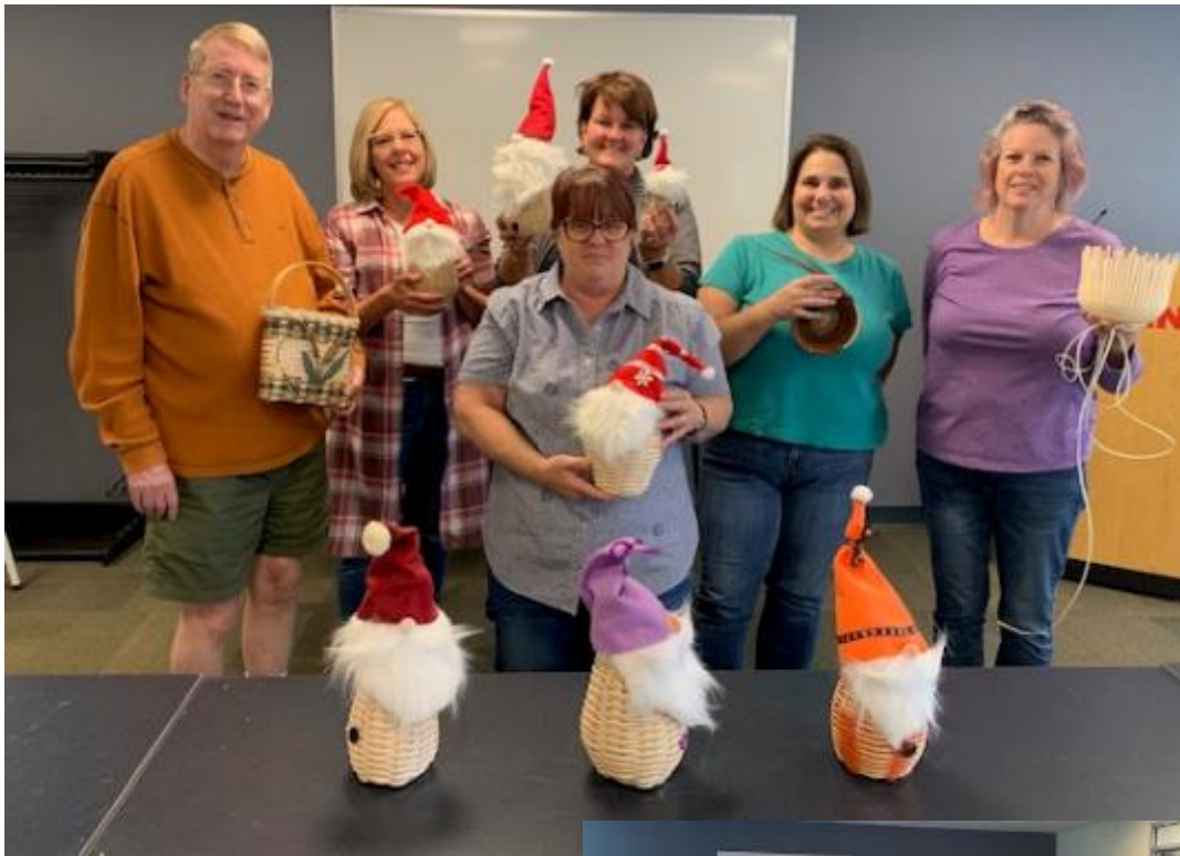
Above and right: Gnomes and open weave in October at Camp Hill.