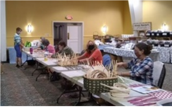
Below: 2021 Odyssey Committee