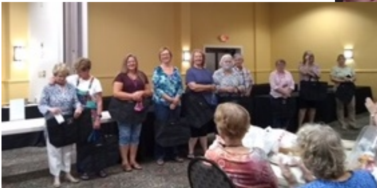
Above: 2021 Odyssey teachers