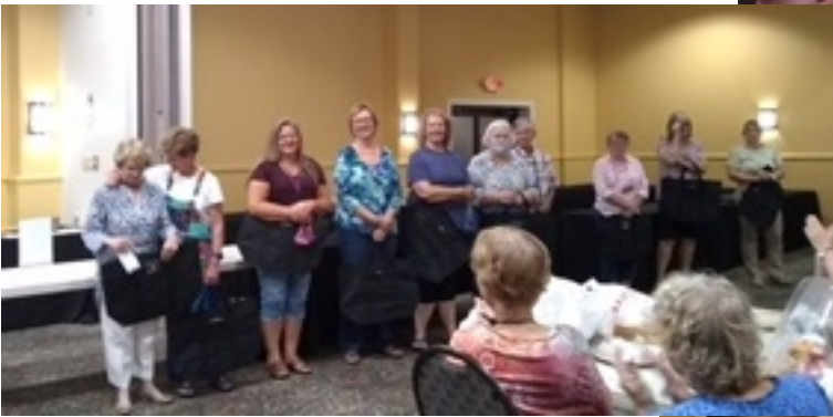
Above: 2021 Odyssey teachers