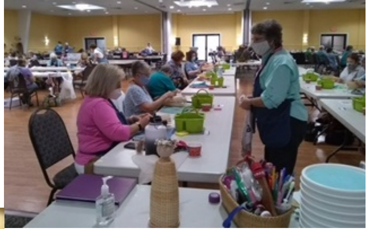
Below: 2021 Odyssey Committee