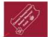
Option 2: On Red Diagonal in Corner White Thread