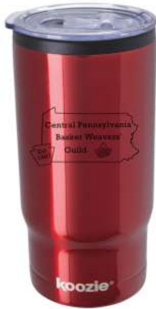
Red Tumbler w/Clear Lid w/1 Color CPABWG Imprint in Black Ink