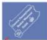
Option 1: On Carolina Blue Diagonal in Corner White Thread