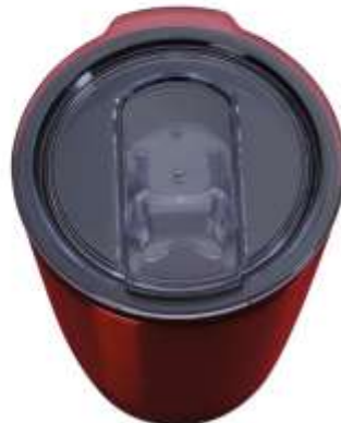
Lid Top View

Use the multifunctional Koozie® Slim Triple Vacuum Tumbler as you like! With just the screw-on black ring, this workhorse holds a slim 12 oz. can or a regular bottle. Drop in the clear spill-resistant plastic lid, and you have an on-the-go tumbler for your coffee or ice-cold drink.