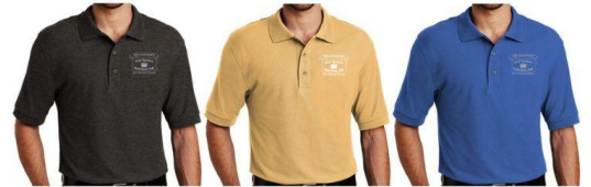
5. K500 Men's Port Authority Silk Touch S/S Polo in Charcoal Heather Gray, Banana, or Ultramarine Blue