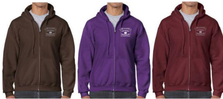
6. G18600 Gildan Full Zip Up Hoodie Dark Chocolate Brown, Purple, or Maroon