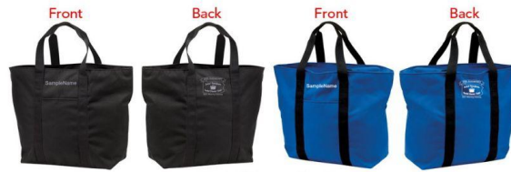
1. B5000 All Purpose Tote Bag Black/Black or Royal/Black Upper Back of Bag Logo in: Silver Steel Thread Personalizations: Front ABOVE Pocket