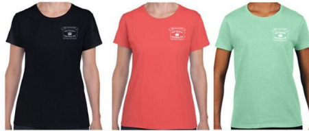
4. G5000L Gildan Ladies 100% Cotton S/S Tee Black, Coral Silk, or Mint Green