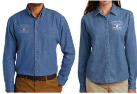
3. SP10 (Men's)/LSP10 (Ladies) Port & Company L/S Denim Shirt in Faded Blue