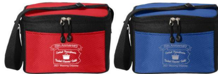
7. BG512 Port Authority 6-Can Cube Cooler Red/Black or Twilight Blue/Black