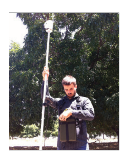
Specifications subject to change without notice.