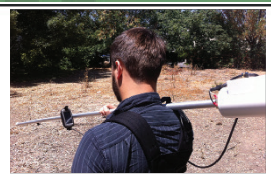
G-857 and Optional Garmin® GPS

correction data and apply it to other land or airborne magnetic data.