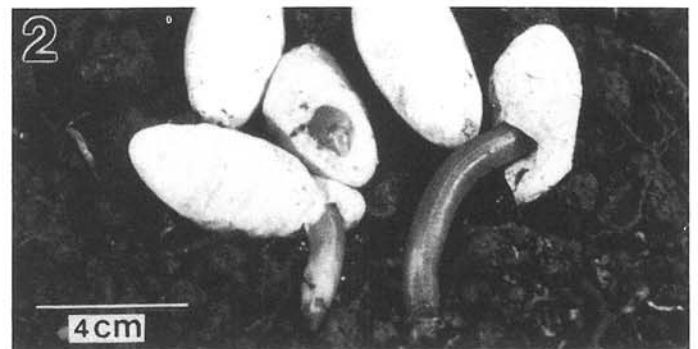
FIG. 2. Hatching of a clutch of Leposternon infraorbitale .