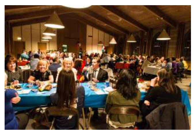
Soirée Trivia at St. Mark's Episcopal Church, Evanston

Another special feature of the event, which corresponded to the theme of la Fête de la Francophonie, was a complimentary tasting of Ouébécois beers, including Fin du Monde, Maudite, and Trois Pistoles. The Quebec Government Office in Chicago contributed a variety of Unibroue beers and a liqueur, Sortilège, to the tasting.