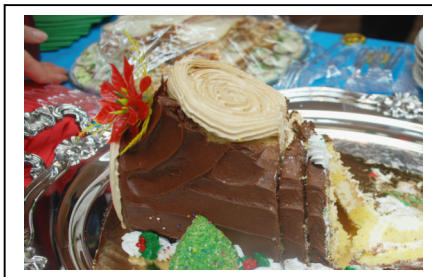
Bûche de Noël 2012