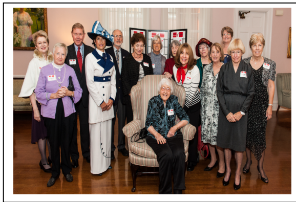
Conseil d'administration de l'AFduNS à la célébration du centenaire.