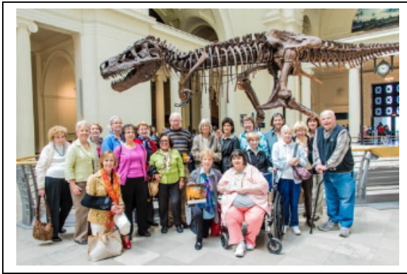
AFduNS members and their guests at the Field Museum for the Lascaux III exhibit and tour.