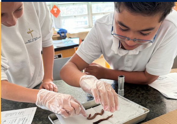
7th grade science experiment with worms!

“All good giving and every perfect gift is from above.”