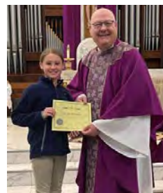
Camille W. Library