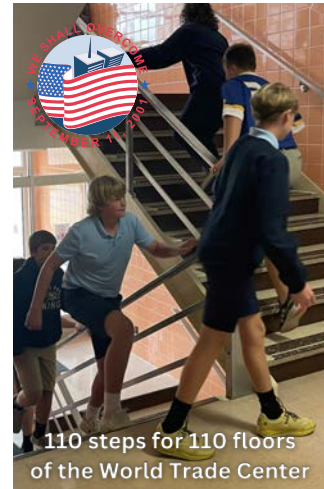
110 steps for 110 floors of the World Trade Center