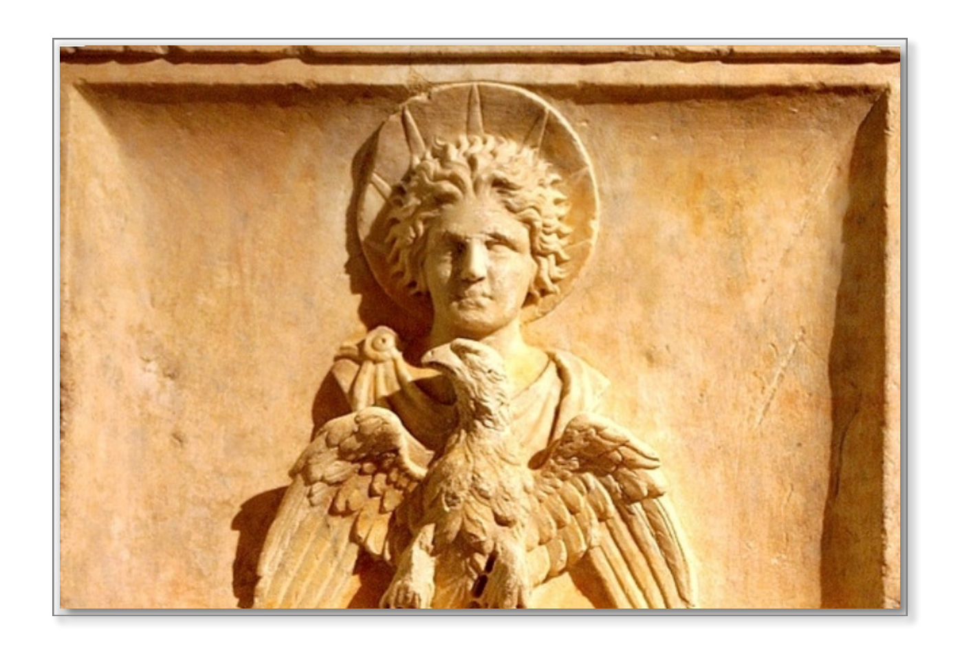
≫Sungod Secrets In the Christian Sanctuary €