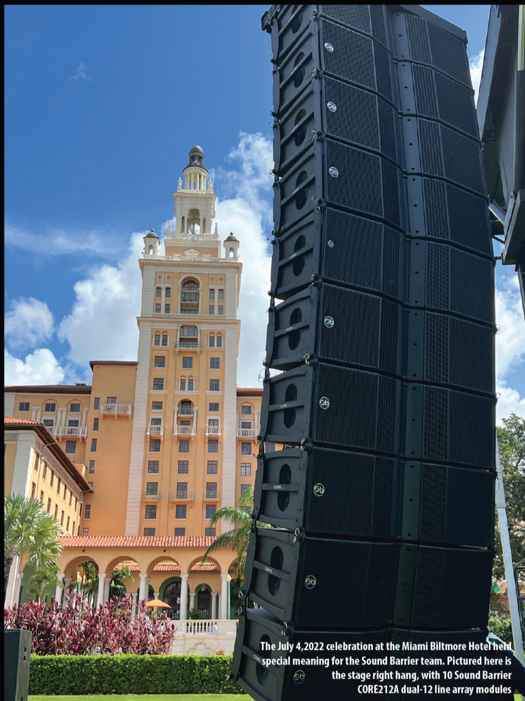
The July 4, 2022 celebration at the Miami Biltmore Hotel held special meaning for the Sound Barrier team. Pictured here is the stage right hang, with 10 Sound Barrier CORE212A dual-12 line array modules

Interface Sound & Production (interface-