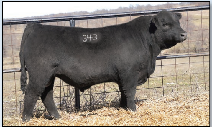
ERTL 314L Mr Prime Time 767 Sells as lot 31