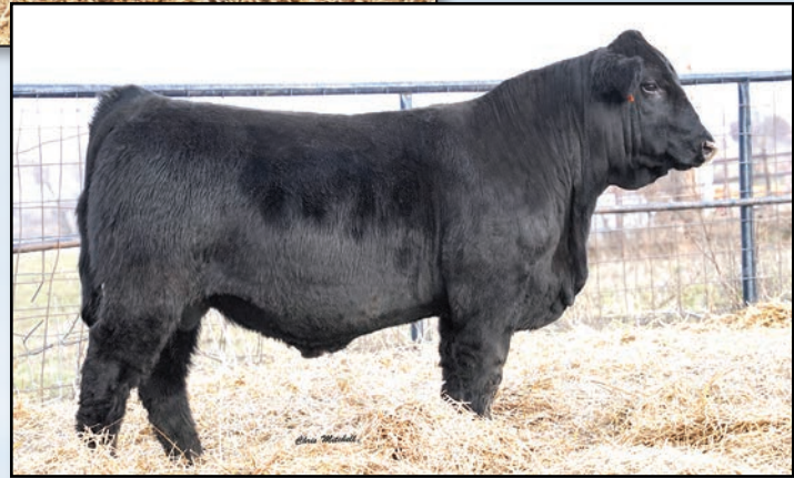
ERTL 328L Mr Desparado 1121 Sells as lot 7