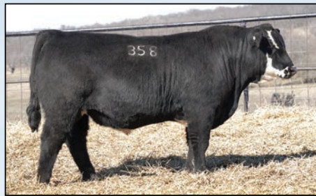
ERTL 358L Mr Warrior 077H Sells as lot 44