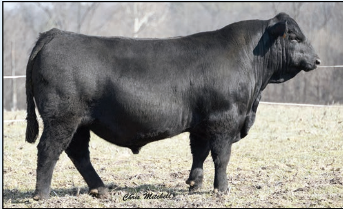
JKGF Civil War E92 Sire of lots 76