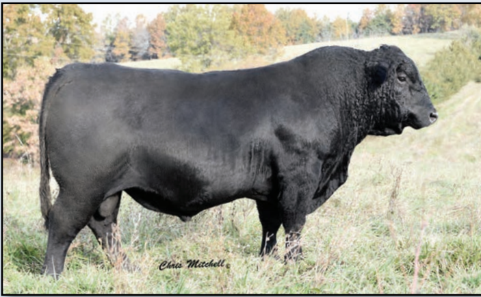
JKG Black Baron D126 ET Sire of lots 53-55