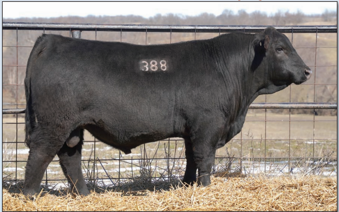
ERTL 388L Mr Warrior 18 Sells as lot 42