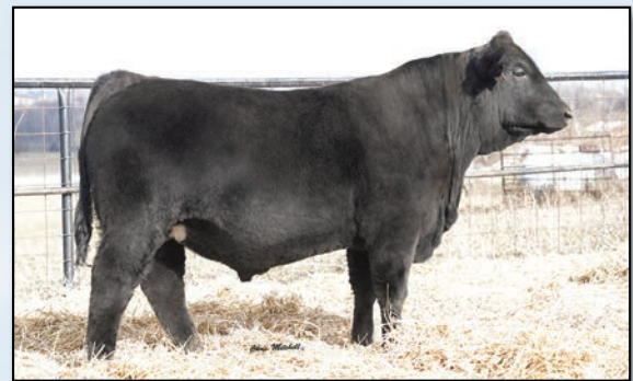
ERTL 338L ET Twister 678 Sells as lot 12