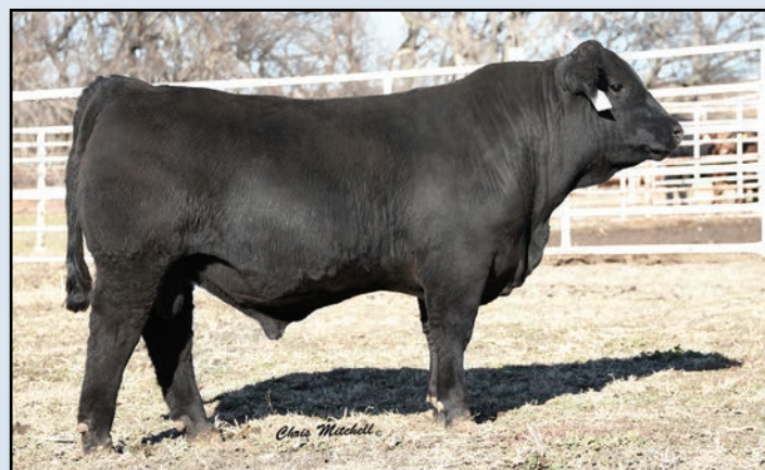
DCSF Post Rock Easy Upgrade 83J2 Sire of lots 78-81