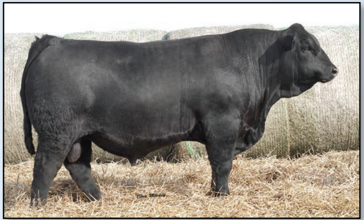
ERTL 275K ET Mr Titan 648 Sells as lot 49