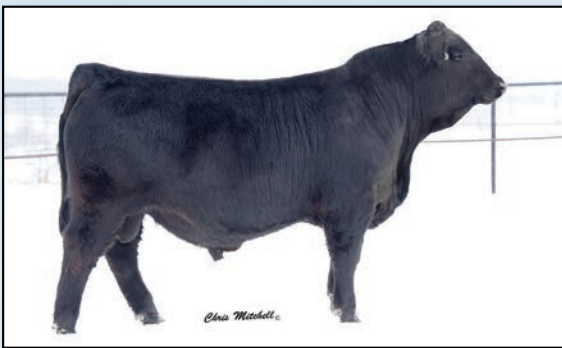
ERTL 067H Mr Twister Ferdinand Sire of lots 11-14