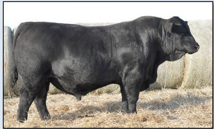
ERTL 274K ET Hercules Sells as lot 48