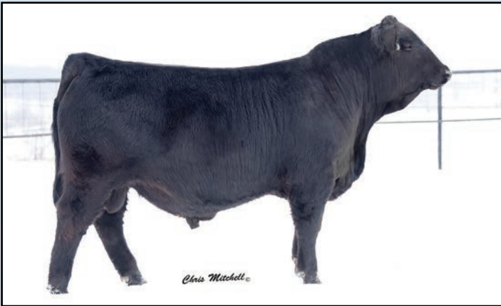
ERTL 067H Mr Twister Ferdinand Sire of lot 58