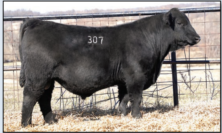
ERTL 307L Mr Texplay 1101 Sells as lot 29