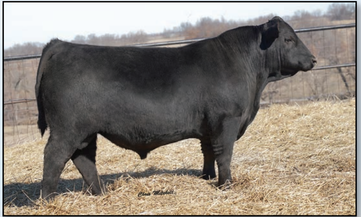
ERTL 261K Mr Kenmore AI sire to lots 67 and 69