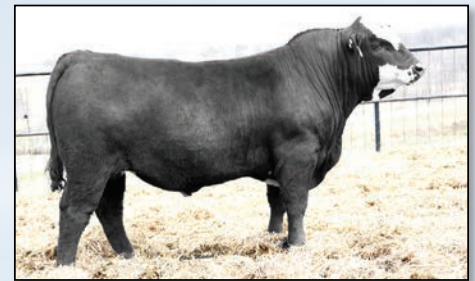
ERTL 106J Mr Warrior Sire of lots 42-45