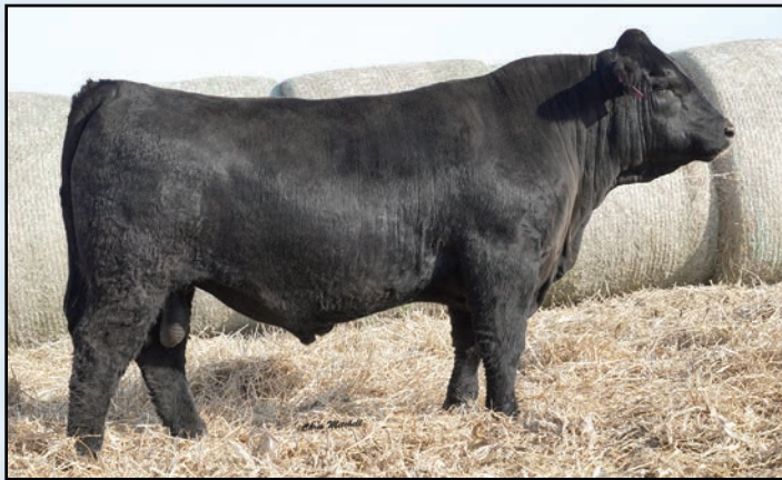
ERTL 296K Mr Twister Barber Sells as lot 56