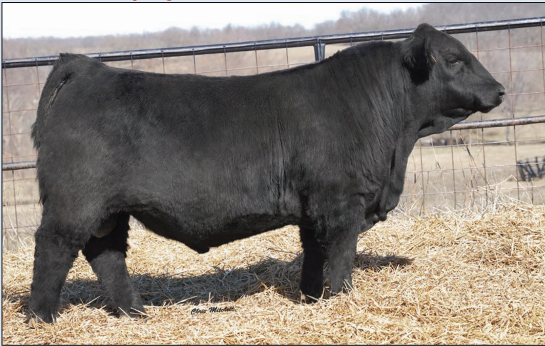
ERTL 384L Mr Desparado 048 Sells as lot 6