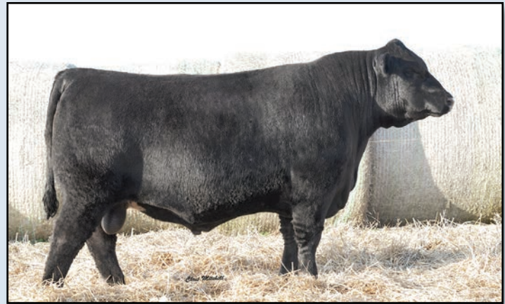
Rawhide 205 Sells as lot 59