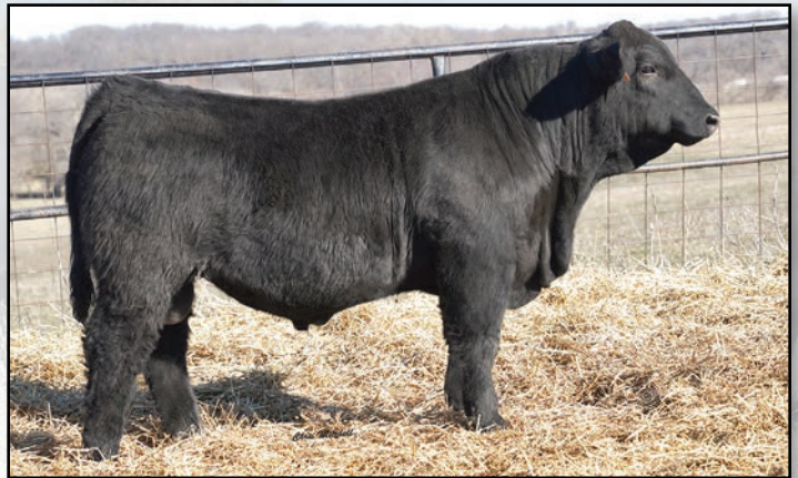
ERTL 390L ET Mr Jackpot Prince Sells as lot 33