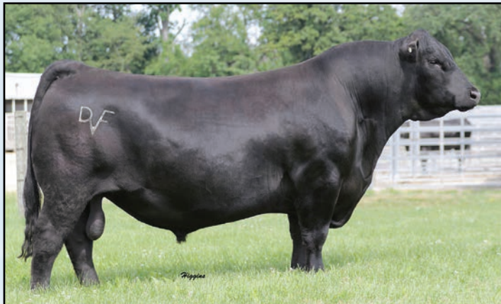
Deer Valley Growth Fund Sire of lot 63