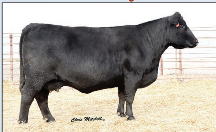
SVVG Rylee Donor dam of lots 61- 62