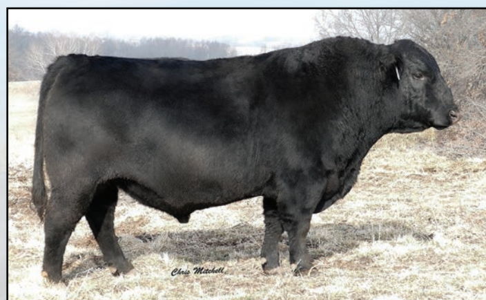
ERTL H21 Mr Texplay F21 Sire of lots 82-83