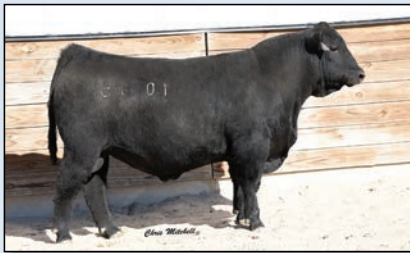
DBRG Mr Mountain Rain 1095J Sire of lots 34-41