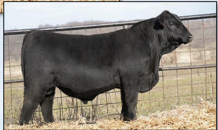
ERTL 339L Mr Chip 927 Sells as lot 2