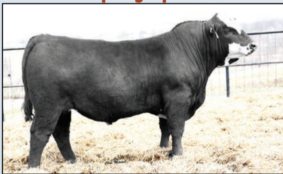
ERTL 106J Mr Warrior Sire of lot 84