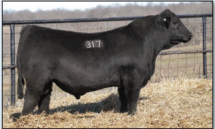
ERTL 317L Mr Prime Time 975 Sells as lot 32