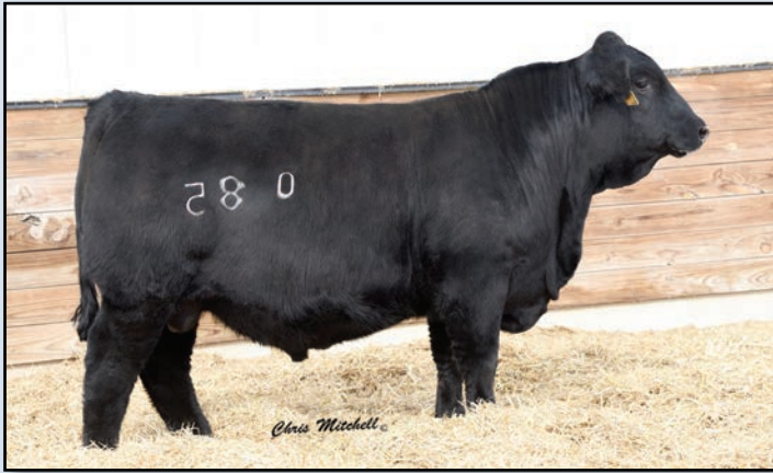
DBRG Mr Desperado 0085H Sire of lots 72-73