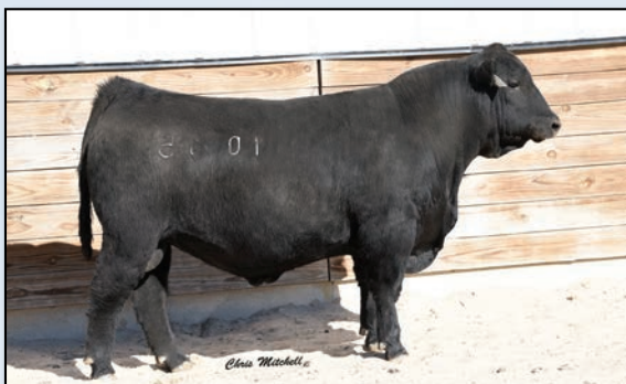
DBRG Mr Mountain Rain 1095J Sire of lot 85-86