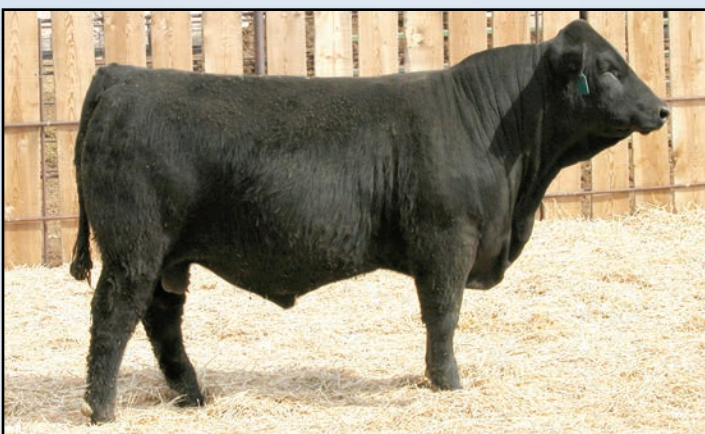
BRBR Saguaro 8111F ET Sire of lots 61-62