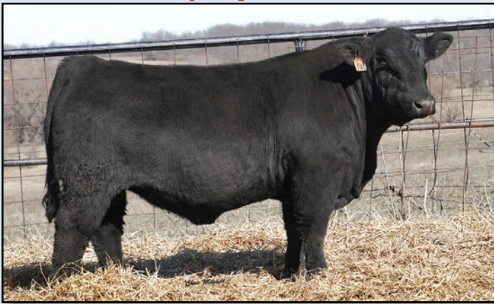
ERTL 347L Mr Rainfall 6F1 Sells as lot 34