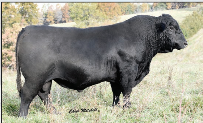
JKGF Black Baron D126 ET Sire of lots 64-65