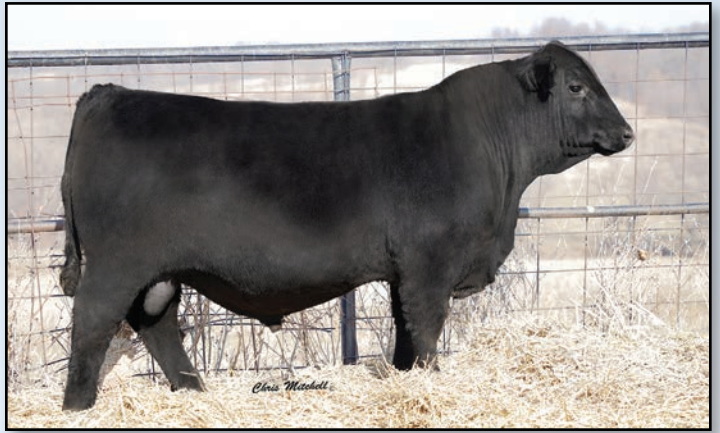
ERTL 238K Mr Exponential Storm AI sire to lots 68 and 71