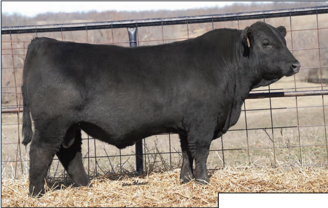
ERTL 367L Mr Niagara 037 Sells as lot 24