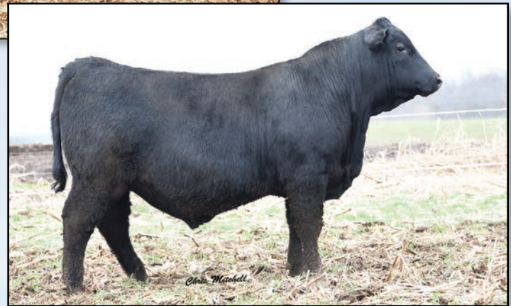
ERTL Niagara 30G5 ET Full ET Brother to Sire of lots 21-23