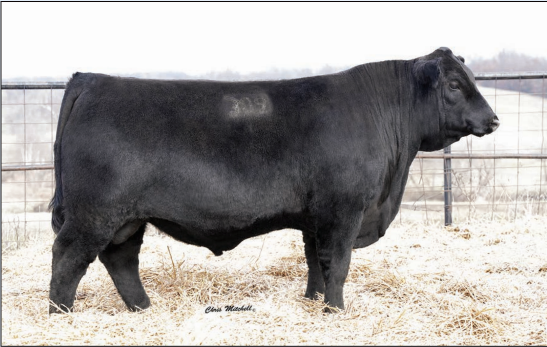
ERTL309L Mr 1963 Sells as lot 46

46 ERTL 309L MR 1963 61%GV 38%AN Balancer Bull Heterozygous Black Homozygous Polled BD: 2/28/2023 ERTL 309L AMG1563862