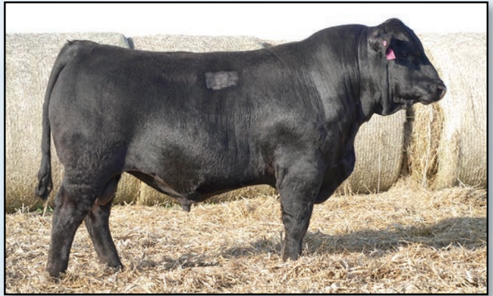
ERTL 277K ET Mr CW 4308 Sells as lot 50