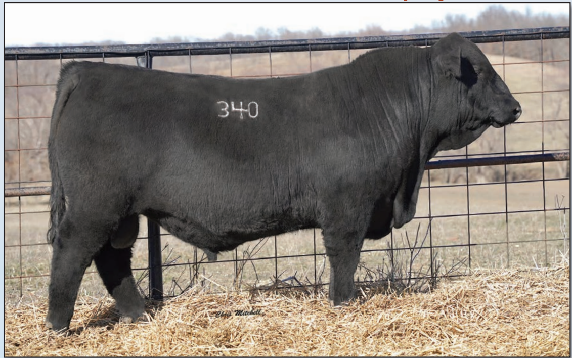
ERTL 340L Mr Ferdinand 445 Sells as lot 11