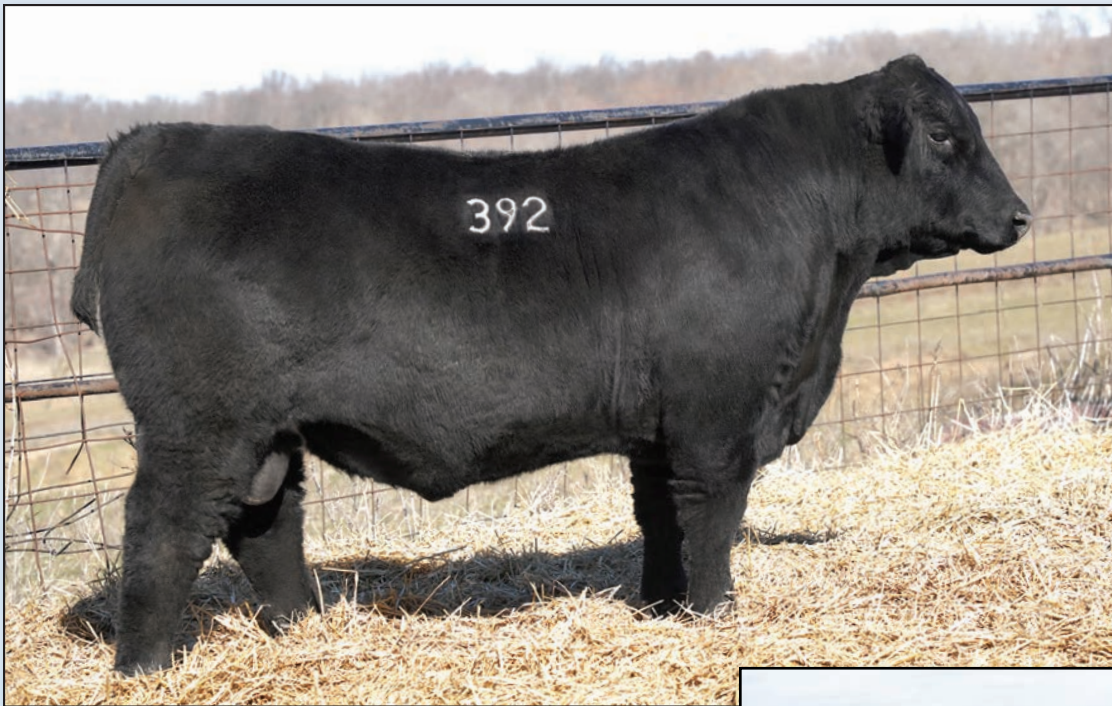
ERTL 392L Mr Saguaro 678 ET Sells as lot 1