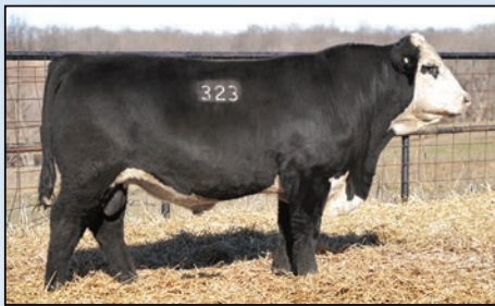
ERTL 323L Mr Warrior Sells as lot 43