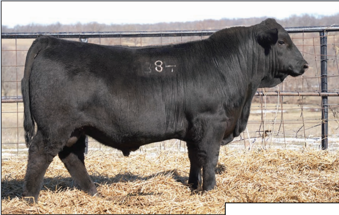
ERTL 384L Mr Desparado 048 Sells as lot 6