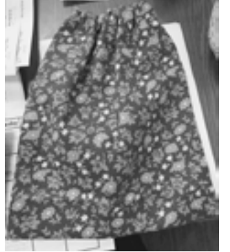
Catheter bag covers

Port pillows (to prevent seatbelt rubbing)