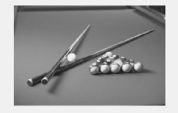
Get 2-4 players together and give us a call! #587-6221