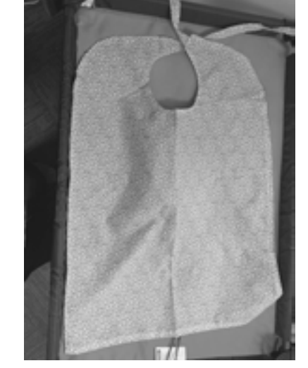
Full size bibs

If you are in need of any of these brand new home-made items, please contact the front desk at the Senior Center!