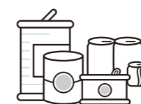
Metal & Aluminum