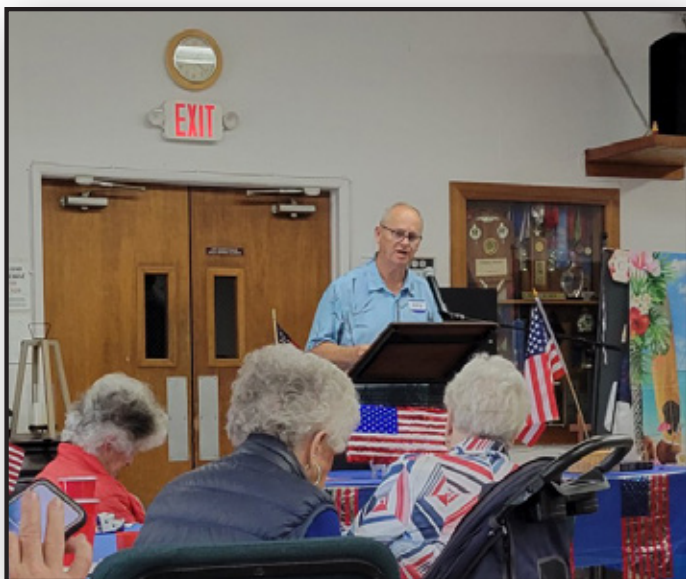
I was invited to speak at a luncheon at 1st Baptist Church in Lemon Grove just a couple of weeks ago. The subject was how to share the gospel with the “false religions” around us. I focused on the Mormons and Jehovah Witnesses. Primarily we must understand the gospel as well as a rough knowledge of how the cults misunderstand the words we use.