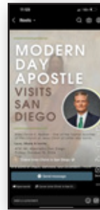
Advertisement on Facebook announcing LDS Apostle speaking in San Diego.

Halloween was truly amazing this year as we learned much from last year. We gave out 600 full size candy bars at SDSU with our new Halloween tract and another 600 at Starlight Circle in Santee. The numbers of people far exceeded what we thought would be there. As we left the streets were so full of people there were no room for cars without people moving out of the way. What an amazing opportunity!