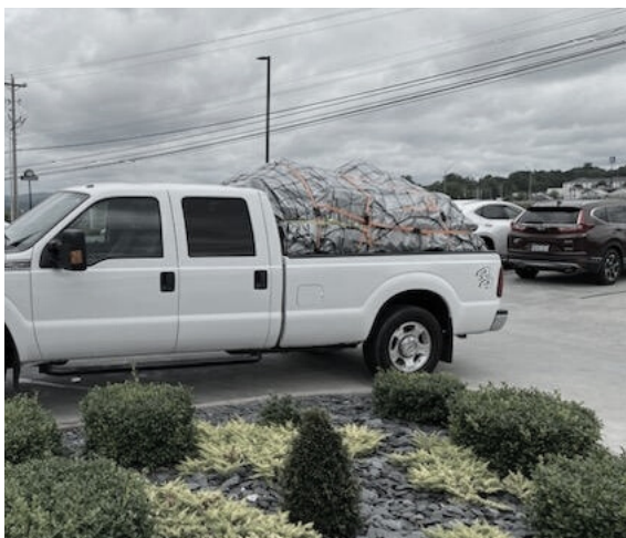
Charles's truck packed and enroute

HRSBC has recently decided to open their Clothes Closet two times a month- the second and fourth Saturdays of each month. Opening the Clothes Closet on these two Saturdays meets the need of the community- apparently these are times when folks tend to run short and need assistance.