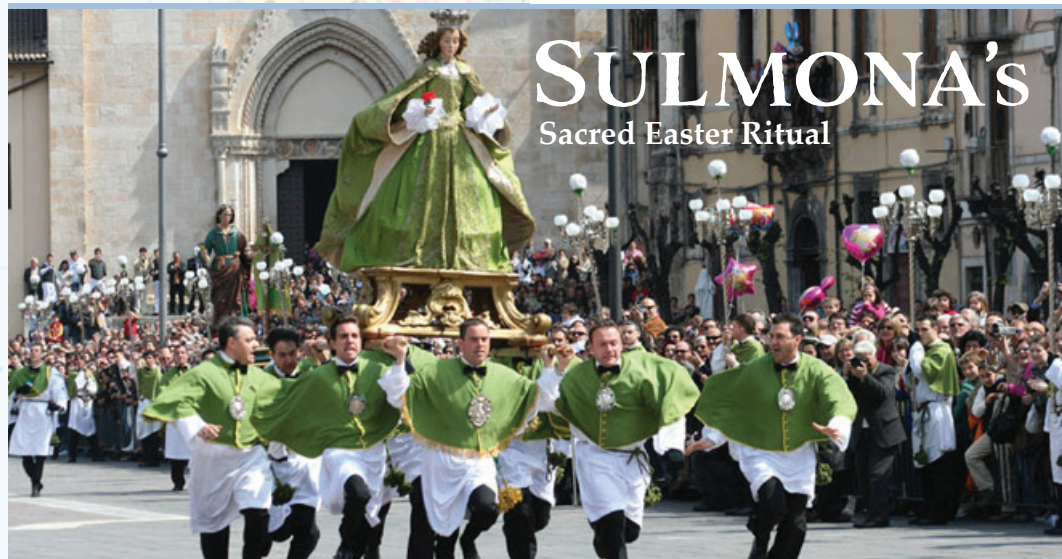
SULMONA’S Sacred Easter Ritual

†Eurostat’s Eurobarometer survey in 2018 *Source: WorldBank