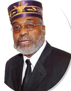
A well prepared man never trembles – African Proverb

The 97th Illinois Council of Deliberation under the auspice of the MICIC Melvin Frierson, will convene on Friday through Sunday, October 17-19-2014 at the Abraham Lincoln Hotel located at 700 East Adams Street, Springfield, Illinois. Illinois Council of Deliberation's (PHA) registration will open on Friday, October 17, 2014 at 10:00Am Central Standard time.