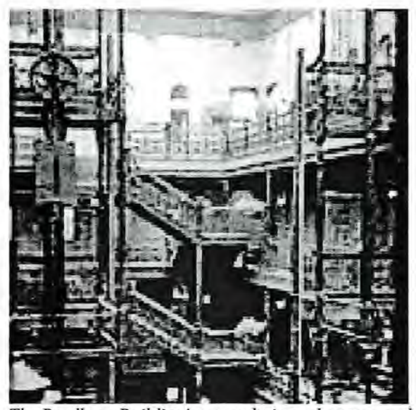
The Bradbury Building's wrought iron elevators and skylit interior provide a truly unique locale

Sam rushes over to a building in which a man is trying not to fall from an open elevator into the courtyard below. Sam shoots a wire from his belt, Batman-style, and swings over to the elevator. Sam tells the man to hang on a little longer, but the man panics and screams, leading some of the bystanders below to think the masked man is trying to kill the man rather than save him.