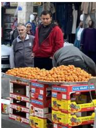
A Fruit Vendor in Bethlehem