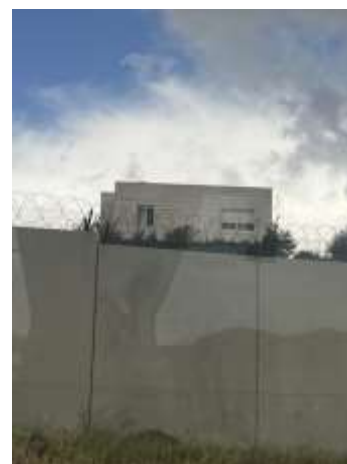
The Wall around Palestine with an armed military outpost,