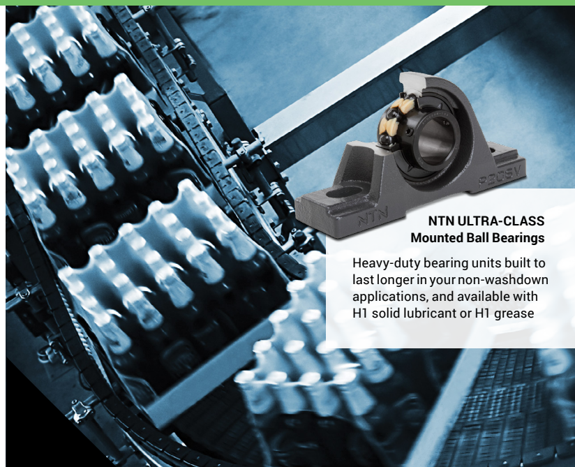
NTN ULTRA-CLASS Mounted Ball Bearings

NTN gives you the total package: products designed to exceed industry standards, expertise in training and installation, and readily available replacement parts through your local distributor at a moment's notice. After decades of experience in the industry, we know exactly what it takes to get the job done right.