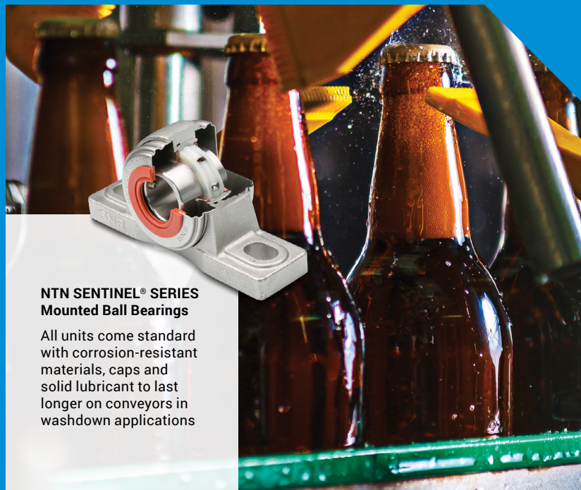
NTN SENTINEL® SERIES Mounted Ball Bearings

All units come standard with corrosion-resistant materials, caps and solid lubricant to last longer on conveyors in washdown applications