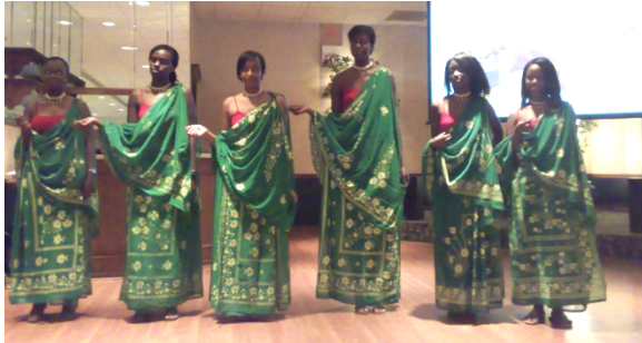
Rwandan Dancers Displaying Costumes