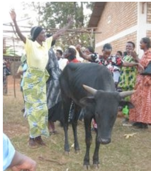
Abasa Member with Donated Cow