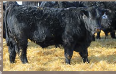
L99 Pure Bred SIM

L99: PB SM SIRE:KBHR HIGH ROAD, DAM:H72, B DATE:4/9/23,B WT:75, ADJ WW:646 ,EPD'S CE:12.54,BR:-7.7,WN84.7,YW:117 MCE:5.6,MM17.2,MWW:58.5 API:145,TI:83