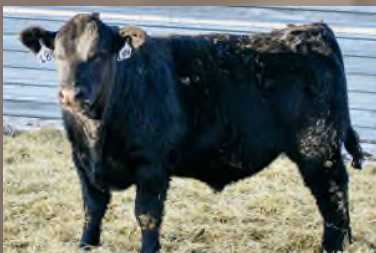
L84 1/2 AN 1/2 SIM

L84: 1/2 AN 1/2 SM BULL SIRE:BASIN PAY- WEIGHT DAM : E239, B DATE:4/8/23 ,B WT:83 ADJ WW:663 EPDS: CE 9.6 ,BR:2.1 ,WN:83.3,YW:127.3,MCE:7.1,MM:28.2,M- WW:68.8,API:130, TI:79