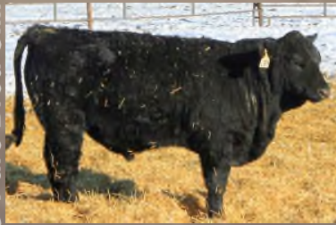
L83 Pure Bred SIM

L83 BULL PB SM SIRE:JTL G73 DAM:D200 B DATE:4/8/23, B WT:80 ADJ WW:663 EPDS:CE11.Y6 BR :1.4 ,WN:87,YW:124.3, MCE:7.1, MM:24.1, MWW:67.1 API:145 TI:86