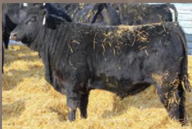
L19 3/4 AN

L19 3/4 ANGUS BULL SIRE:PAYWEIGHT DAM :JTL C47 B DATE:3/30/23 BWT:78 ADJ WW:609 EPDS:CE13.3, BR:-.6, WN:73.2 YW 116.4, MCE:9, MM:30.3,MWW:67.3 API:130 TI:71