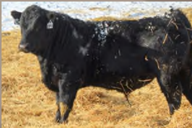
L46 Pure Bred Slim

L46 PB AN SIRE:PAYWEIGHT DAM:C44 B DATE:4/4/23 B WT:70 ADJ WW:650 EPDS: CE:13.4 BR:-1.3 WW:73.2 YW :115.9 MCE: 8.5, MM:29.3, MWW:66.6