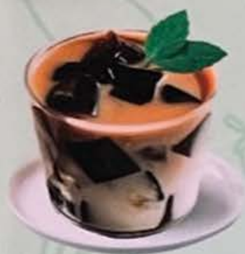
Coffee Milk with Jelly $5.00