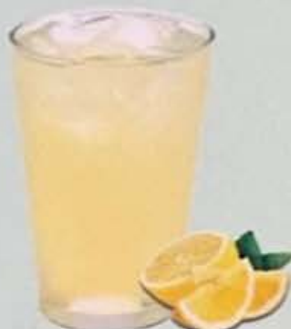
Fresh Squeezed Lemonade $3.00