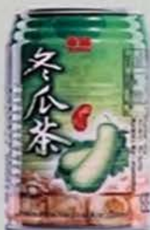
White Gourd Juice $3.00