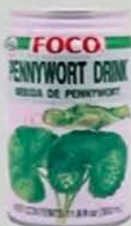
Pennywort Juice $3.00