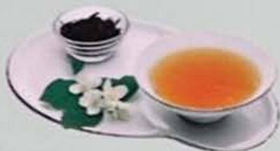
Hot Jasmine Tea $3.50