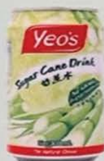
Sugar Cane Juice $3.00