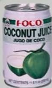
Coconut Juice $3.00