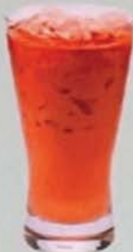
Thai Iced Tea $4.00