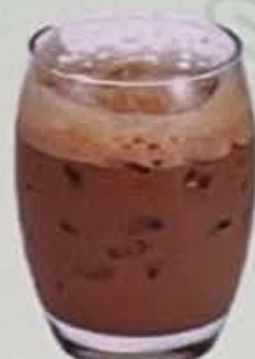
Iced Milk Coffee $5.00