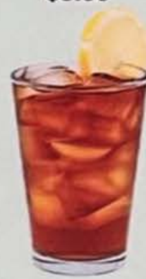
Sweet Iced Tea $2.00