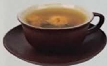
Chrysanthemum Tea $3.00