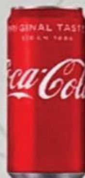
Coca Cola Products Coke, Diet Coke, Sprite, Sunkist, Root Beer, Dr. Pepper, Dasani $2.00