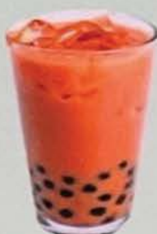
Thai Tea with Jelly $6.00