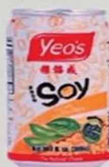
Soy Milk $3.00