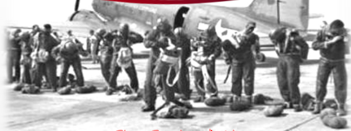
The Triple Nickles