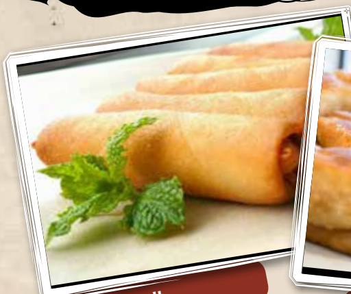
1 Spring Rolls