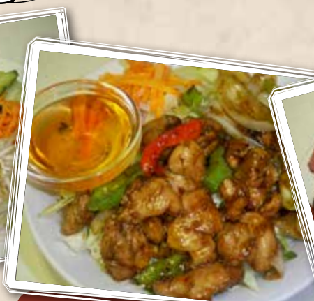
47 Lemon Grass Chicken Bowl