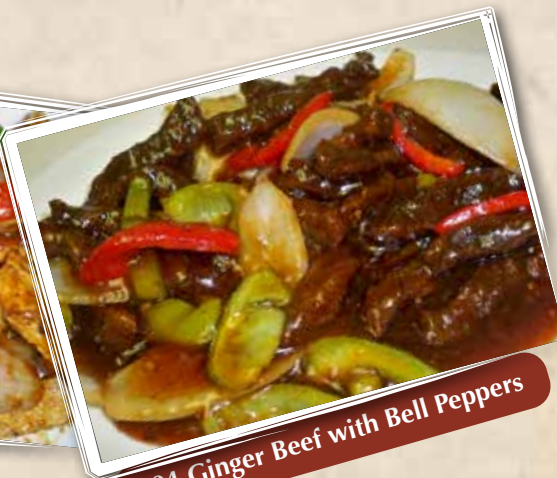
104 Ginger Beef with Bell Peppers