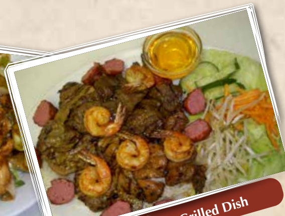
57 Saigon Special Grilled Dish