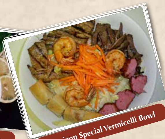
38 Saigon Special Vermicelli Bowl