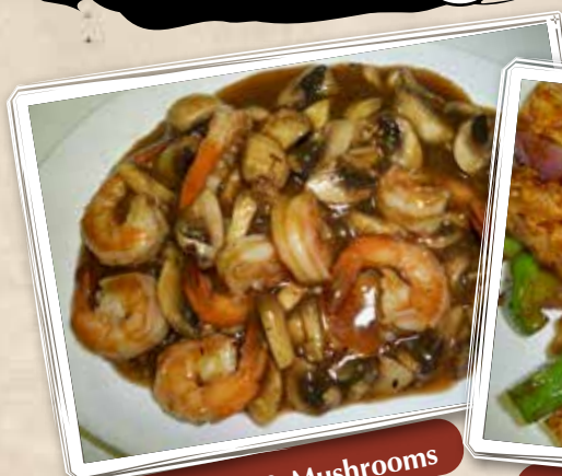
117 Prawns & Mushrooms