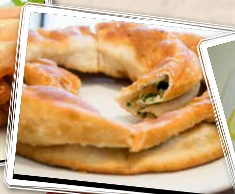
5 Green Onion Cakes