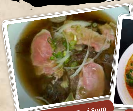
33 Saigon Special Beef Soup