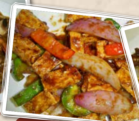
149 Lemongrass Tofu