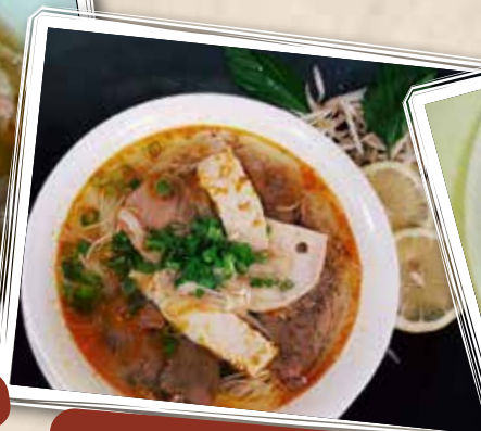
27 Spicy Vietnamese Soup