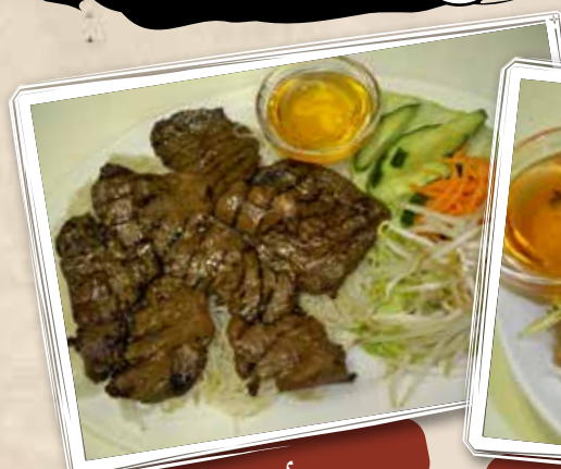
52 Grilled Beef