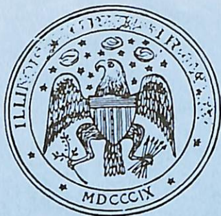
Seal of the Illinois Territory, sketched by the late Mr. Brand Whitlock and reproduced in the Journal of the Illinois Historical Society.

Annual Report Filing Fee $ 5.00 Annual Report with Change of Agent or Office $10.00