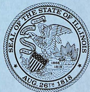
Present Great Seal bearing altered design introduced in 1868. This design is far removed in meaning from that of the original Seal.