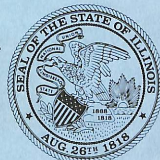
Present Great Seal bearing altered design introduced in 1868. This design is far removed in meaning from that of the original Seal.