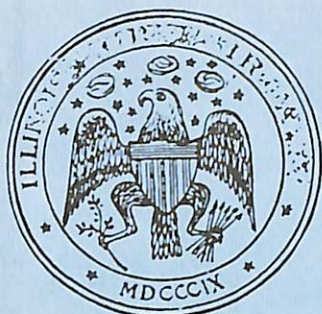
Seal of the Illinois Territory, sketched by the late Mr. Brand Whitlock and reproduced in the Journal of the Illinois Historical Society.

Annual Report Filing Fee $ 5.00 Annual Report with Change of Agent or Office $10.00