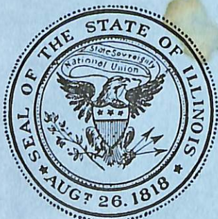
Second Great Seal of the State of Illinois. While this design differed from the first Seal, it remained unchanged in a heraldic sense.