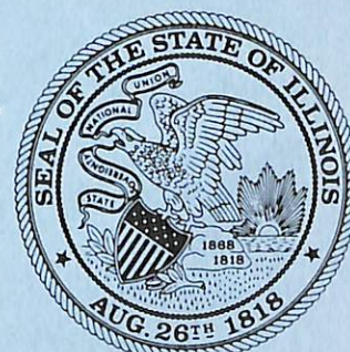
Present Great Seal bearing altered design introduced in 1868. This design is far removed in meaning from that of the original Seal.