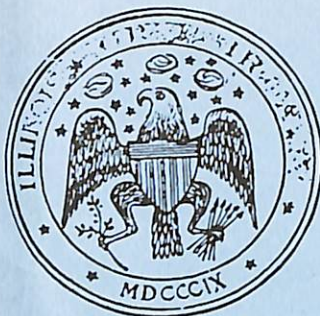
Seal of the Illinois Territory, sketched by the late Mr. Brand Whitlock and reproduced in the Journal of the Illinois Historical Society.

Annual Report Filing Fee $ 5.00 Annual Report with Change of Agent or Office $10.00 File No. N 5085-257-1