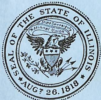
Second Great Seal of the State of Illinois. While this design differed from the first Seal, it remained unchanged in a heraldic sense.