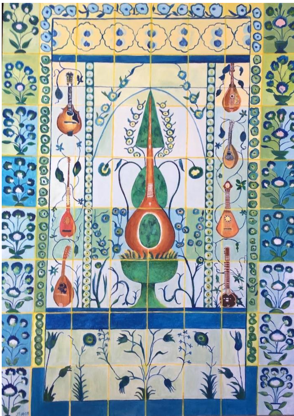
Jade Music 50" x 36" The Mandolin is a path to perfection.