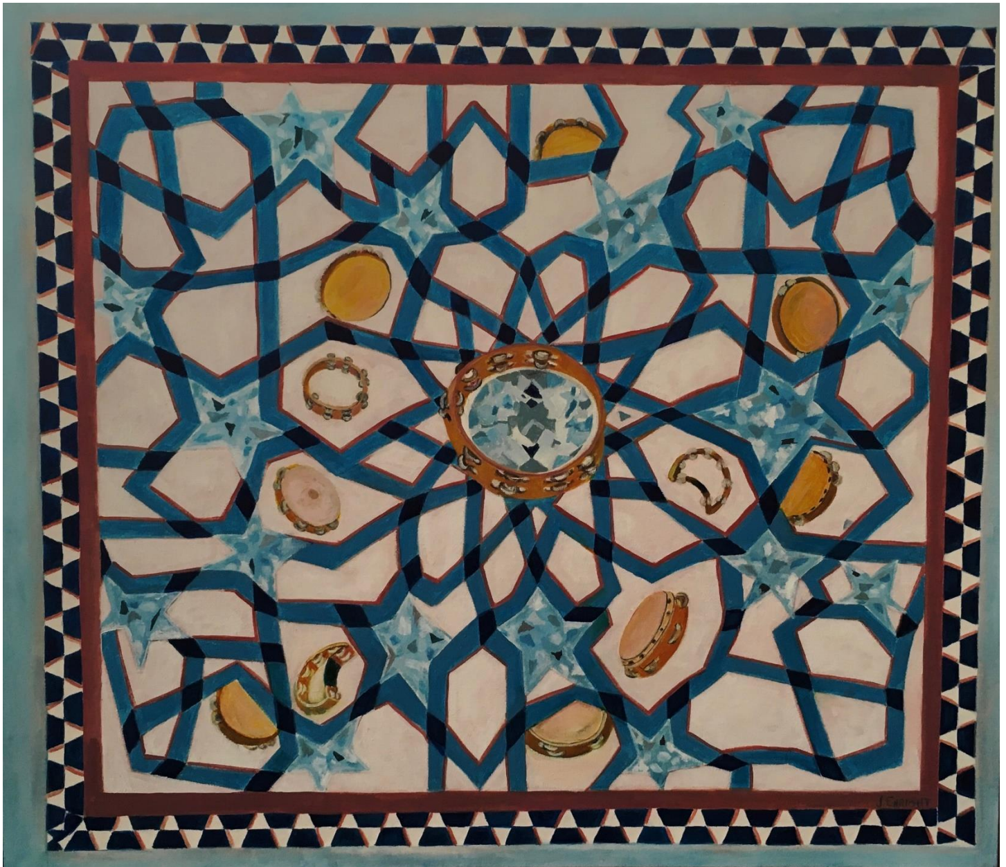
Aquamarine 36" x 48" The tinkling sounds of the tambourine.