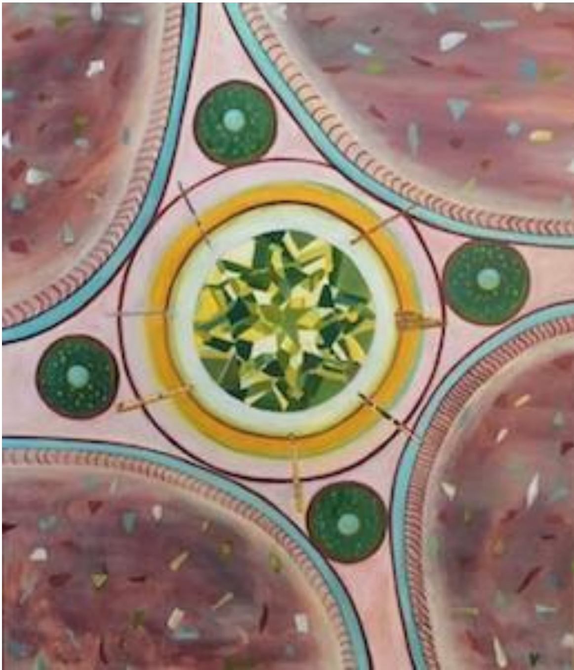
Peridot Music 42" x 36" Mellow Flutes