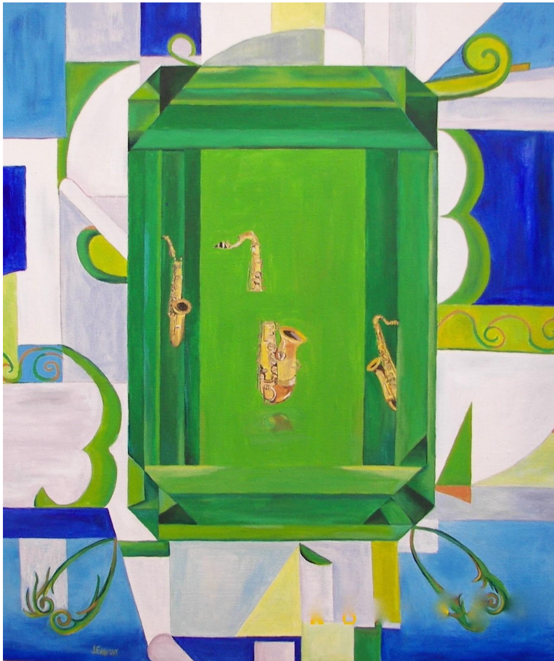
Emerald of Music 42" x 36" - Saxophone Sounds