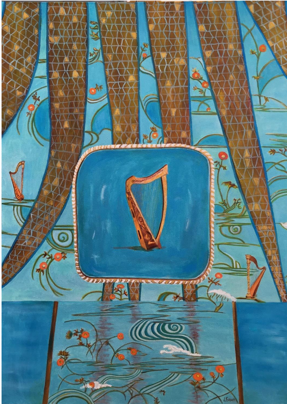
Turquoise 50" x 36" Harp Sounds