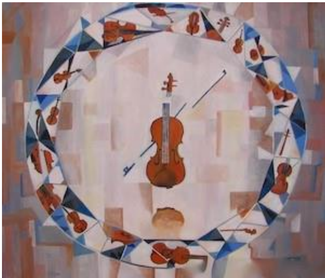
Diamond of Music 36" x 42" - Sounds of the Violin