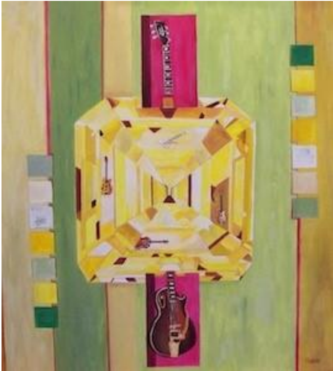
Amber Music 42" x 38" Guitar Sounds