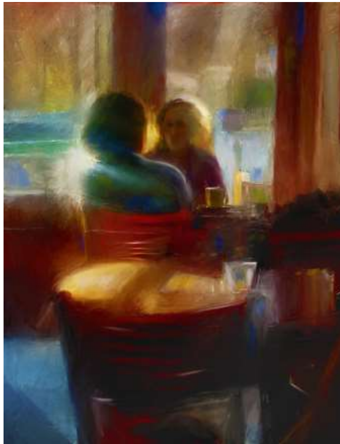
Wednesday Lunch, digital painting

MFA (60 hours), Wichita State University