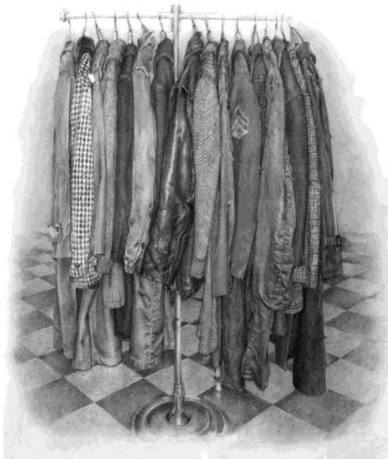
Gathering of Men, 10 x 12, graphite