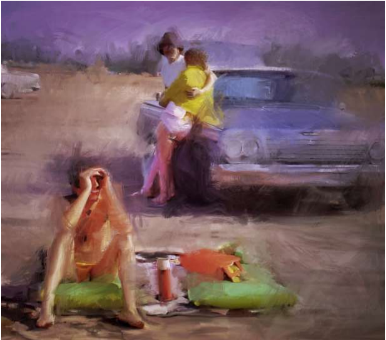
At the Lake, digital painting

All that is the present will soon be in the past; as soon as we say “now” it has become history. My art seeks to explore time as it flows through us and we flow through it.