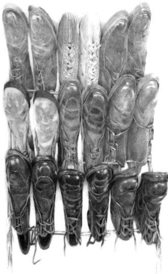
Many Miles, 10 x 12, graphite