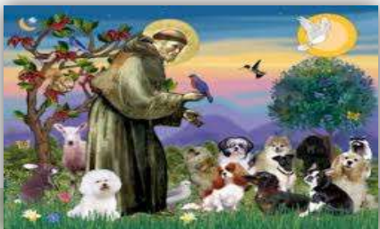
Blessing of the animals Sunday, October 8<sup>th</sup> at 1pm

October 14<sup>th</sup> ~ Roadside Rosary ~ Prayers for our World, 12:00pm