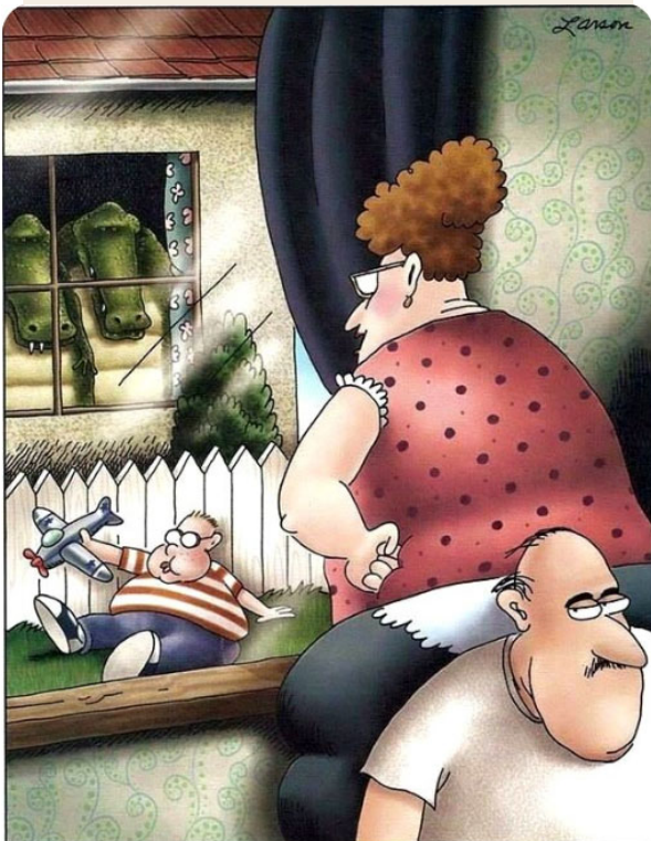
"I just don't like it, Al... Whenever Billy goes outside, the new neighbors seem compelled to watch every little thing he does."

Woodland Place has CC&Rs already in place, ( https://www.mywoodlandplace.com/forms-docs ) but they were not developed and chosen by the homeowners. This is primarily due to the fact that Premier Fine Homes, who built our houses and neighborhood, filed generic CC&Rs before officially turning the neighborhood over to our HOA. Therefore, since April 2020, we have been tied to rules and regulations that do not serve our unique needs or address what is important to YOU!